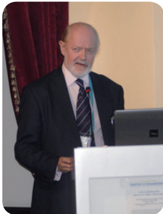
Participants at the WWAP side event to present the Side Publications series, Fifth World Water Forum, Istanbul, 18 March 2009

d'Expertise Hydrique du Quebec, Ouranos/Ministry of Transport of Quebec/Hydro-Quebec). Other topics included: water footprints (University of Complutense/University of Twente); inland waterborne transport (PIANC); water security and ecosystems (UNEP); water-related disasters (ICHARM); the need for information, knowledge and monitoring (WWAP Secretariat); institutional capacity development (UNW-DPC); and citizen mobilization in adapting to climate change (ISW).