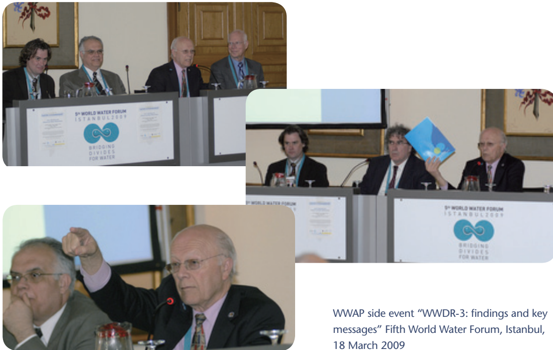
WWAP side event “WWDR-3: findings and key messages” Fifth World Water Forum, Istanbul, 18 March 2009

Comments from participants were included in a document titled “Lessons learned from WWDR-3 and suggestions for WWDR-4”, which was based on remarks and suggestions from selected participants in the production of the WWDR-3 who were invited to respond to a series of four question about the process. This document will be further developed and used as a basis for the discussions for the production of the WWDR-4.