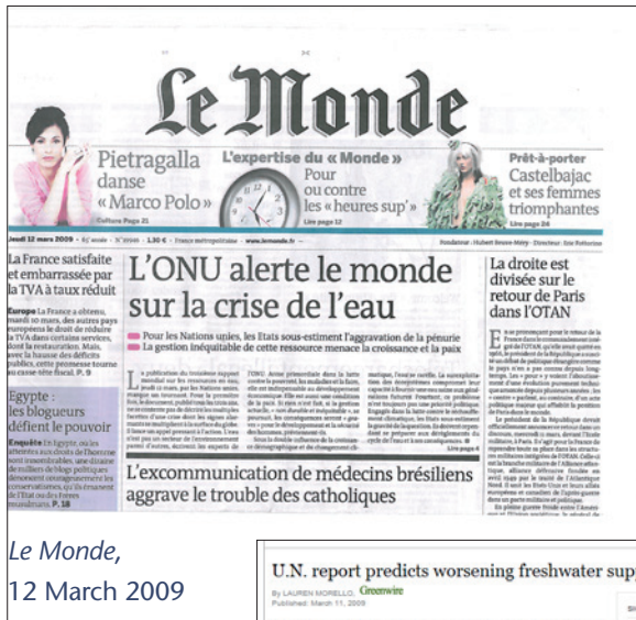
Le Monde, 12 March 2009