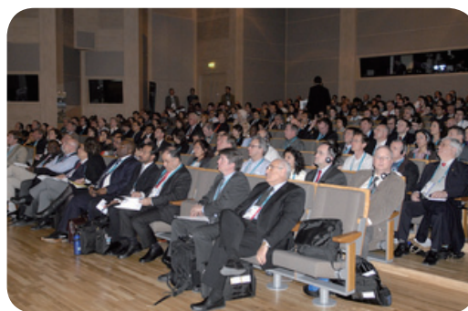
Participants at the launch