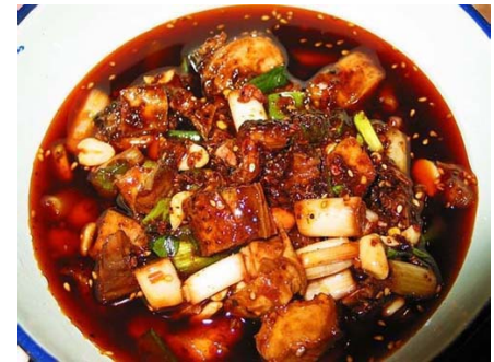
■ Diced rabbit in chili oil 二姐兔丁