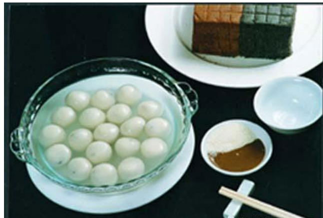
■ Boiled glutinous rice ball 赖汤圆