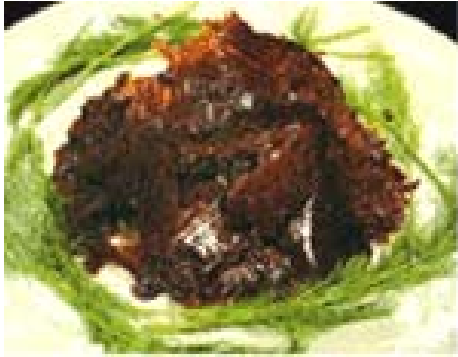
■ Shredded beef in chili