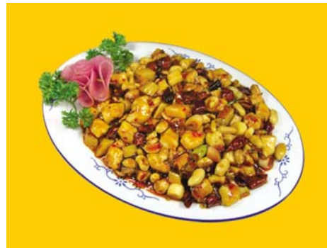
■ Stir-fried diced chicken with peanut and chili 宫保鸡丁