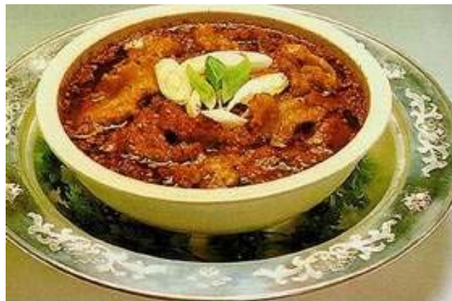
■ Boiled sliced beef in hot sauce 水煮牛肉