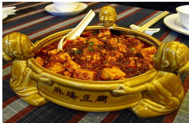
■ Ma po bean curd 麻婆豆腐