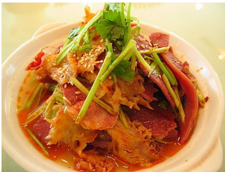
■ Sliced beef and ox's tripe in chili oil 夫妻肺片