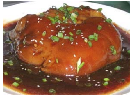
■ Traditional braised pork leg 东坡肘子