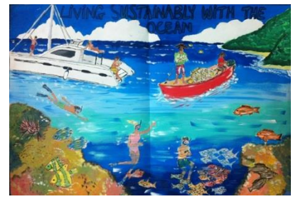
© UNESCO / Lisette, Seychelles (18 years old), Winner of the competition highlighted the concept of the 'blue economy' that is currently being promoted by the Seychelles government to all countries worldwide