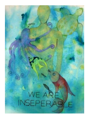
© UNESCO / Emma and Nour, Tunisa (14 years old), Collage work illustrating the beauty of ocean. She stressed the need to save our ocean resources in saying that "they are all that we have, they are our world."