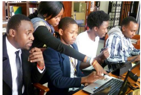
The YouthMobile Initiative aims to empower youth with the high-level skills and confidence to create mobile apps that are locally-relevant and contribute to the reduction of chronic youth unemployment

17 July - 28 Aug, 2014, Nairobi - A series of intensive workshops on mobile application development for sustainable development has been ongoing over the summer in Nairobi in partnership with the Dev School and Kenya National Commission for UNESCO. This initiative aims to empower youth with the high-level skills and confidence to create mobile apps that are locally-relevant.