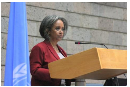
Sahle-Work Zewde, Director-General of the UN Office at Nairobi opens the event in the remembrance of the Westgate terrorist attack that took place on 21 September, 2013

"Never before has the work of the United Nations been so crucial, as part of our collective efforts to address the pressing challenges facing our world – from peace and security to climate change, and from development to human rights."