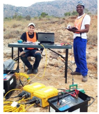
Students sets up the seismic system and collect GPR data for analysis.