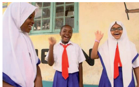
ICTs in education promoted in East Africa among young girls through the uptake of "Women in African History: An e-learning tool"

24 April 2015, Addis Ababa – In support of Girls in ICT day, UNESCO is rolling out its 2014 Gem-Tech award winning Open Educational Resource "Women in African History: An E-Learning Tool" across East Africa in partnership with Camara Education. The tool is an interoperable internet platform that consists of multimedia content and promotes the ICT competencies of young girls. It also represents a crucial step to expand and disseminate knowledge of the role of women in African history to counter prejudices and stereotypes.