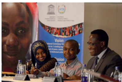
Prof. Jacob Kaimenyi, Cabinet Secretary, Ministry of Education, Science and Technology discuss issues on quality and equity in education with selected students at EFA GMR launch in Kenya.