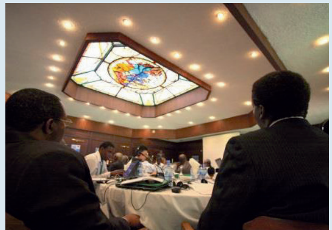
Participants discuss the work plan and prioritize activities on ocean and coastal management issues