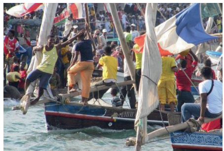
Dhow is commonly used in Lamu. In order to preserve and encourage the art of dhow sailing, the town's finest dhows are selected to compete, and race under sail through a complicated series of buoys, combining speed with elaborate tacking and maneuvering skill during Lamu Cultural Festival.