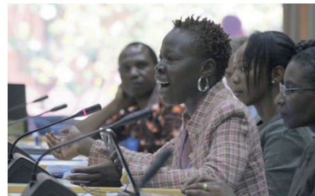
Panelists and students engage in discussion on existing laws, protocols and conventions combating modern forms of slavery, as this topic remains a taboo for the majority of the people in the Kenyan society.

23 March 2015, Nairobi - The 2015 theme for the International Day of Remembrance of the Victims of Slavery and the Transatlantic Slave Trade, "Women and Slavery" is aimed at: paying tribute to the many enslaved women who endured unbearable hardships from forced labour to sexual exploitation; paying tribute to those who fought for freedom from slavery and advocated for its abolition; to celebrate the strength of enslaved women, many of whom succeeded in transmitting their African culture to their descendants despite the many abuses that they endured.