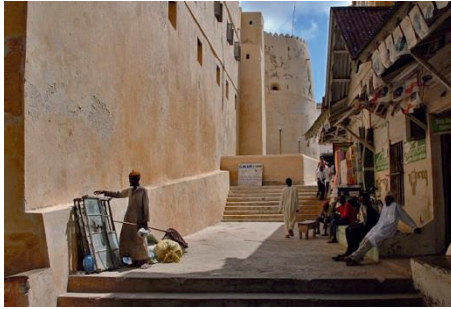
Lamu Fort was built between 1813 and 1821 providing a base from when the Omanis consolidated their control of the East African coast. Today it houses an environmental museum and a library, and is often used for community events.

A crossroad of Bantu, Arabic, Persian, Indian and European Cultures