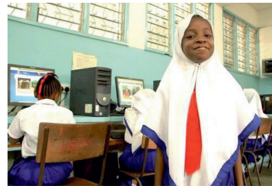
ICTs in education promoted in East Africa among young girls through the uptake of Women in African History: An E-Learning Tool

13 February 2015, Kigali — The Sub-Saharan Africa Regional Ministerial Conference on Education Post-2015 took place on 9-11 February 2015 in Kigali, Rwanda. The conference provided an opportunity to review and assess progress made in attaining the Education for All (EFA) goals set in 2000. The aim was to prepare an African vision for the post-2015 education agenda. On top of that, the conference was also meant to define the education needs, obstacles, and priorities in the region to develop recommendations for the World Education Forum.