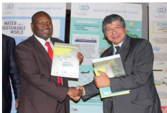
Participants share ideas related to sustainable water management issues during the discussion