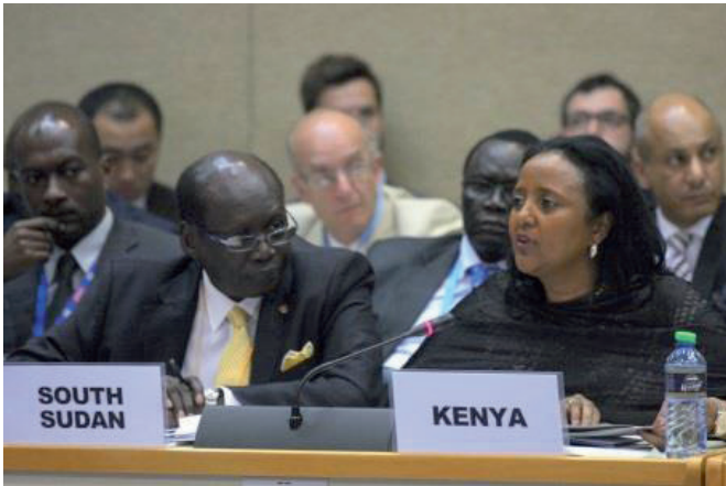
Amina Mohamed, Kenya Cabinet Secretary for Foreign Affairs addresses the Member States on Kenya’s effort in working with the international community to take measures to improve the humanitarian condition in South Sudan

“We need to ensure that our humanitarian groups on the ground are able to move. Since the onset of the conflict the situation has worsened. What we saw during our visit to the region was devastation and destruction as well as a desperate need for food, water, education and health care.” - Valerie Amos, UN Under-Secretary-General for Humanitarian Affairs and Emergency Relief Coordinator