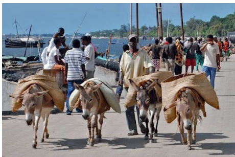
Lamu is the only one of the Swahili settlements and seaports that has constantly been inhabited for over 700 years.

UNESCO together with partners, supports the identification, protection and preservation of cultural heritage around the world considered to be of outstanding value to humanity.