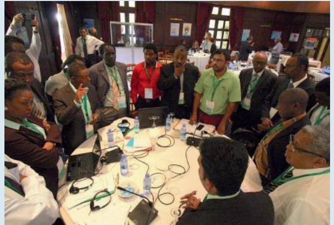
Participants, including the representatives from 23 member states, UN agencies, regional programmes, NGOs and experts in marine science celebrate the closing of the session