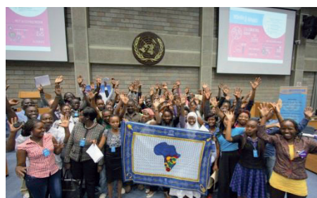
Young reporters and producers from local radio stations celebrate the World Radio Day at the UN Office in Nairobi

13 February 2015, Nairobi – UNESCO partnered with Media Council of Kenya (MCK), United Nation Information Centre (UNIC) and Kenya Broadcasting Corporation (KBC) to mark the World Radio Day 2015 celebrations at the United Nations Complex in Nairobi, Kenya, themed "Youth and Media". The 2-day event aimed at increasing the level of participation of young people in radio taking into account media ethics as producers of radio contents with media literacy skills and mobilizing and encouraging main stream media and community radios to promote access to information, freedom of expression and youth empowerment through their programs.