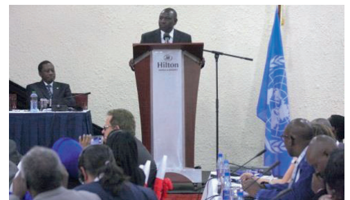
Hon. William Ruto, Kenya's Deputy President at the Opening Ceremony, assures Kenya's commitment to continue its collaboration with neighboring countries to address the problems of poverty, inequalities and related issues