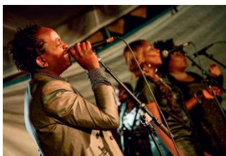
Above: Eric Wainaina, a popular singer-song writer, described jazz as a medium that allows him to communicate and investigate people's feelings on day-to-day issues