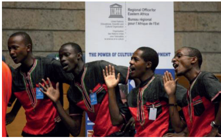
UNESCO Youth Group Choir performs at the UN Office in Nairobi for the World Day for Cultural Diversity celebration

19 May 2015, Nairobi – A Roundtable calling for further dialogue on Culture and Development and the mainstreaming of culture in national policy frameworks within the context of the Post-2015 Development Agenda took place on the occasion of the World Day for Cultural Diversity for Dialogue and Development at United National Office in Nairobi. The event was organized by UNESCO, in collaboration with the Kenyan National Commission for UNESCO, and the United Nations Information Centre (UNIC). More than 100 people from the heritage and cultural industry sector across Kenya participated in the Round Table. Participants included government officials from both central and county governments, cultural experts, academia, artists, creators/producers/practitioners, media and civil society organizations.