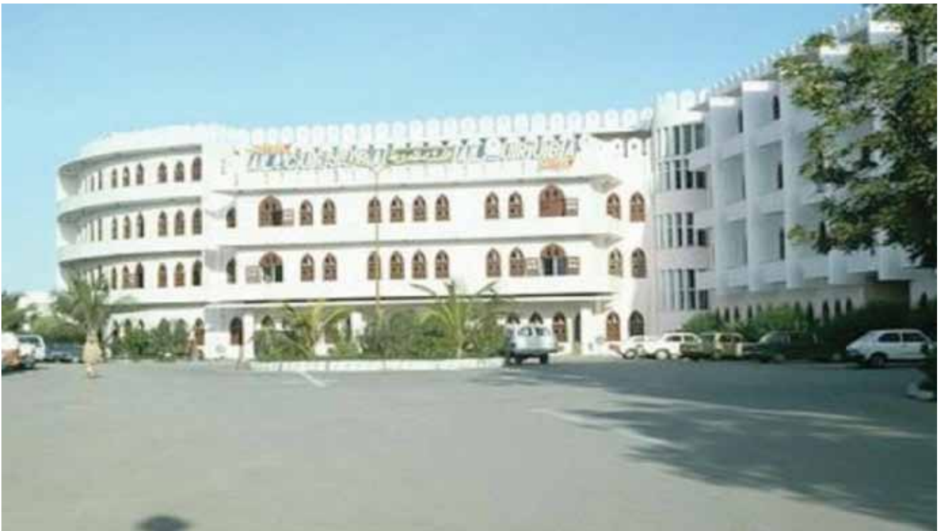
Al Uruba hotel before the civil war.