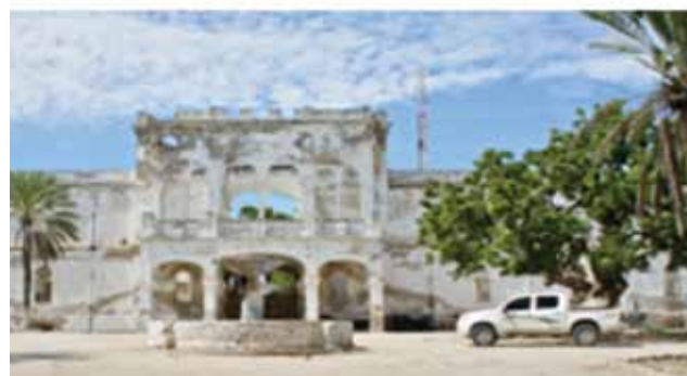
Mogadishu city hall before and after the civil war.