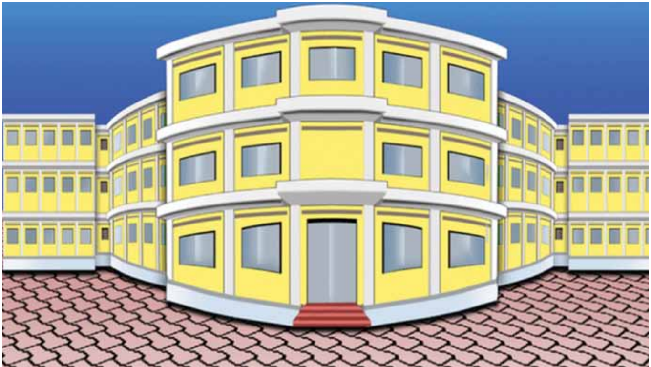
Proposed Somalia National Library.

Although Mogadishu has more than 50,000 students at all levels of education 97 , it does not have a public library 98 . Therefore, the Heritage Institute for Policy Studies (HIPS) 99 , Somalia's first independent, non-profit, non-partisan think tank has decided to start a project aimed at rehabilitating the former National Library, a four storey government building at the heart of Mogadishu 100 . Three floors will be shared by languages (Somali, Arabic and English), fiction and non-fiction books, journals, textbooks and DVDs.