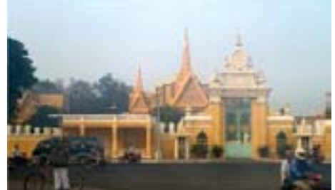
Royal Palace, Phnom Penh

We are of course optimistic that more visitors will be attracted to Cambodia because we have many tourist destinations such as Siem Reap, Phnom Penh, and the northern eco-tourist zones of the country. Based on our vision, in 2006, 1.5 million visitors will arrive, and the number of tourist arrivals will reach 2 million in 2008, and 3 million in 2010, which will create 360,000 jobs and generate national income worth millions of US dollars.