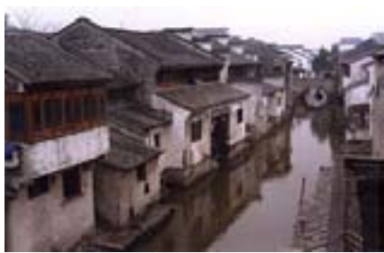
Shaoxing City, China

This 2,500-year old district in Shaoxing City is characterised by 19<sup>th</sup> and 20<sup>th</sup> century traditional waterways and streetscape, surrounded by Chinese vernacular architecture. With the involvement of the government, the refurbishment of the district was carried out in only 5 months.