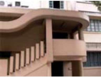
Far Eastern University

A campus-wide program to restore its Art Deco buildings achieved astonishing and unexpected results. The conservation program re-established pride of place with students, faculty, and alumni.