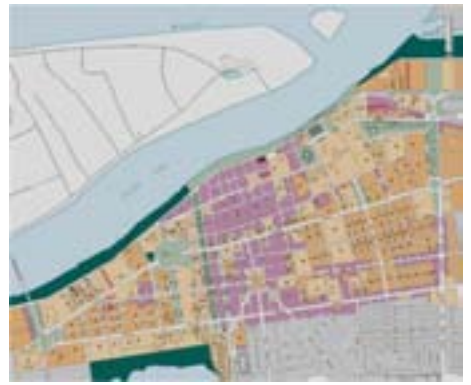
Phnom Penh, historic quarter

However, the main challenges for Phnom Penh are its rapid population growth and simultaneous development. The balance of investment interest and the concept of sustainable development (globalisation) have caused the idea of historical preservation, as well as the preservation of national character, to be almost ignored. So, the Municipality of Phnom Penh has now made efforts to address these in the setting up its Master Plan 2020.