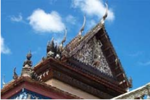
Wat Bo, Siem Reap

The pagoda is therefore a structuring element in both the urban and village landscape. These various elements, whether being furnishings or the architecture itself, are therefore a special object of attention.