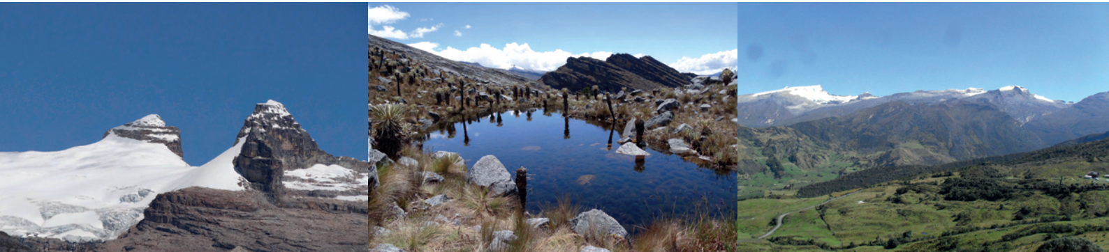
Sierra Nevada del Cocuy, Boyacá, Colombia