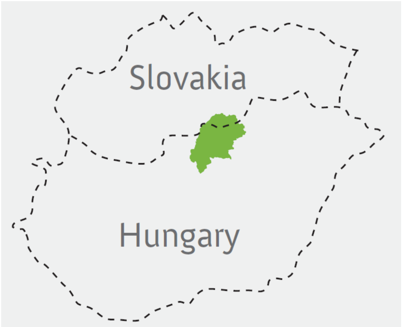
Map of Slovakia and Hungary showing location and size of Novohrad - Nógrád Global Geopark