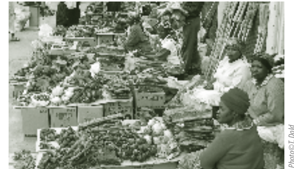
Informal medicinal plant market at a taxi rank, South Africa.