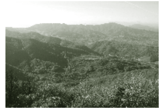
Tuscany – cultural landscape, Italy.

The interruption of traditional practices like mixed cultivations, terraces, wood pastures, tree rows, and hedges that characterized farming until the 1950s has been replaced by extended monocultures created with mechanization. This has created a landscape where the diversity is mostly due to morphological features (e.g. hills, mountains, valleys). Modern agriculture and forestry, as well as the abandonment of agricultural lands has