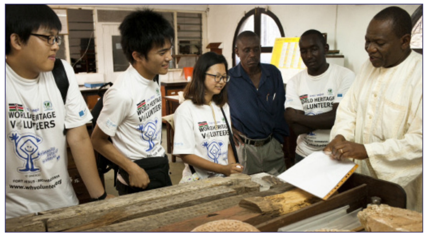
WHV - Fort Jesus, Mombasa, Kenya / GVDA (August 2012)