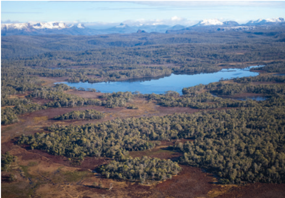
Skullbone Plains

There are no known cultural heritage sites on the Liffey Reserve however no formal surveys have been undertaken. The existence of sites with local heritage value remains a possibility as the Liffey area has a long history of European and Aboriginal use.