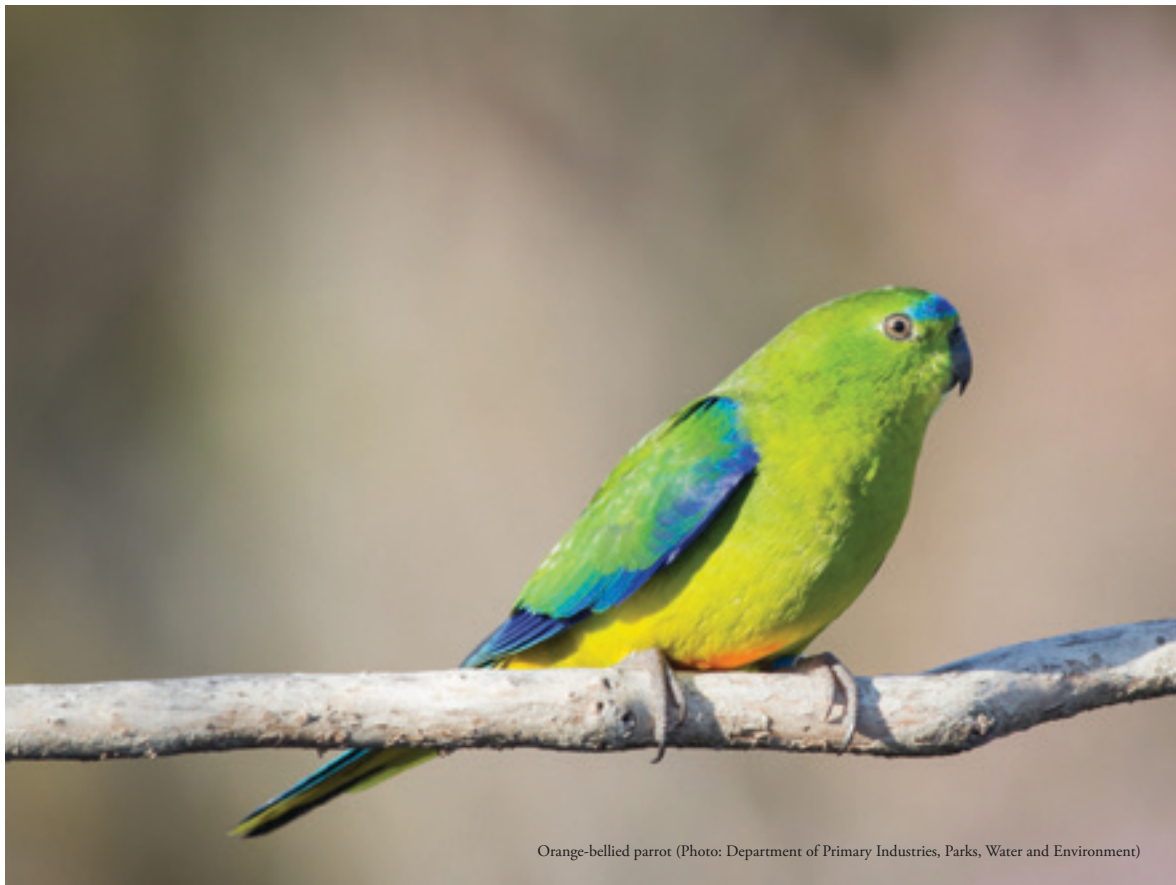
Orange-bellied parrot

A captive insurance population is another important element in the recovery programme for this species. Releases of captive bred birds into the wild are seen as critical actions to promote long-term survival in the wild. In the 2013-14 breeding season 24 captive bred birds were released at Melaleuca. A number of these birds successfully bred and fledged chicks, augmenting the 2013-14 breeding productivity of the species. Importantly, a number of captive-bred and released adults and their wild-fledged offspring returned to the Melaleuca breeding site at the start of the 2014-15 breeding season, almost doubling the numbers of Orange-bellied parrots returning to Melaleuca to breed. A translocation of 27 birds has recently been conducted at Melaleuca in the 2014-15 breeding season. Further translocations will be considered for coming breeding seasons.