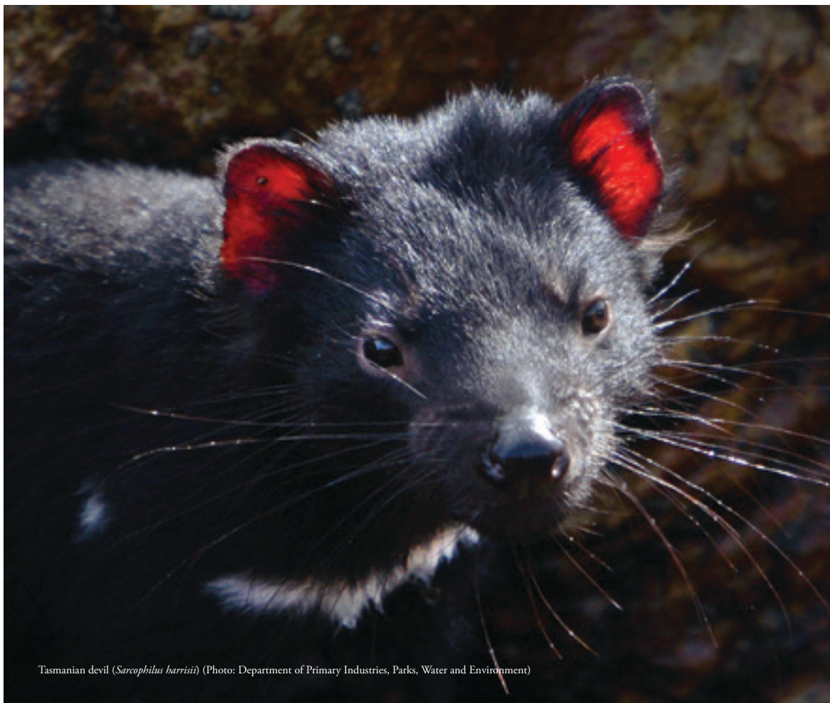
Tasmanian devil ( Sarcophilus harrisi )

The Australian Government committed $A3.3 million in project funding in 2014 and the Tasmanian Government is providing $A2.3 million annually to the Save the Tasmanian Devil Program. Through the implementation of a diverse range of research and management actions, considerable progress has been made