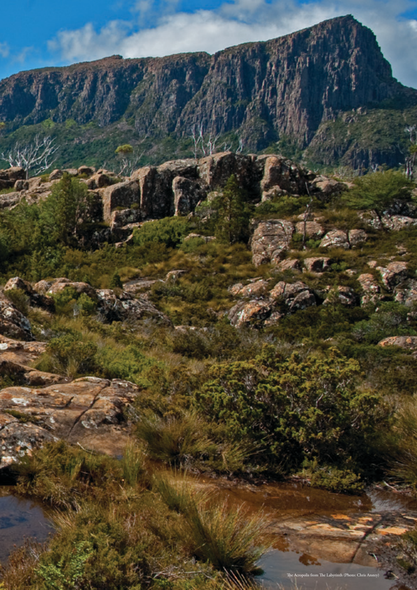
The Acropolis from The Labyrinth