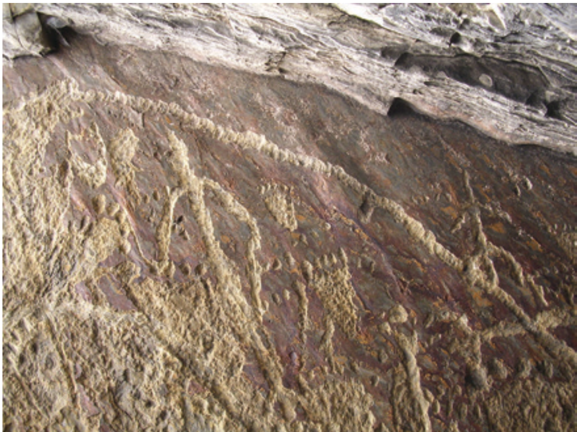
Human and Wallaby tracks adorn an Aboriginal rock shelter in South West Tasmania

The relevant Tasmanian law is the Aboriginal Relics Act 1975 (Tas). Under the Act, it is illegal to “destroy, damage, deface, conceal, or otherwise interfere with a relic”. Cultural sites are also protected under Tasmania's National Parks and Reserves Management Act 2002 and National Parks and Reserved Land Regulations 2009 , which provide for the care, control, preservation and protection of National Parks and reserves. In particular, the National Parks and Reserved Land Regulations 2009 provide comprehensive protection for reserved land and prohibit removing, damaging, defacing or disturbing any Aboriginal relic or any object of archaeological interest.