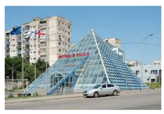
Police Station, Tbilisi