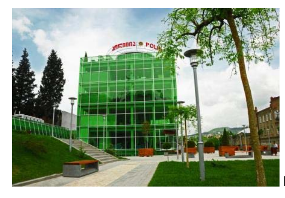
Police Station in Old Tbilisi