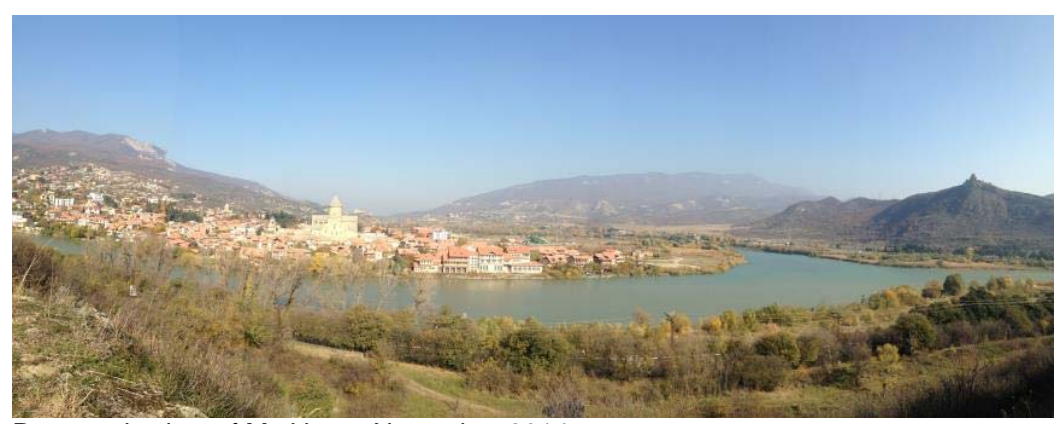
Panoramic view of Mtskheta, November 2014