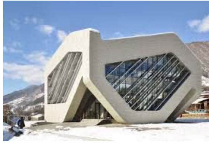
Jurgen Mayer H. Architects