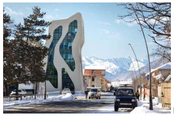
Jurgen Mayer H. Architects