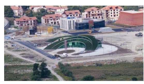
Police Station in Mstkheta