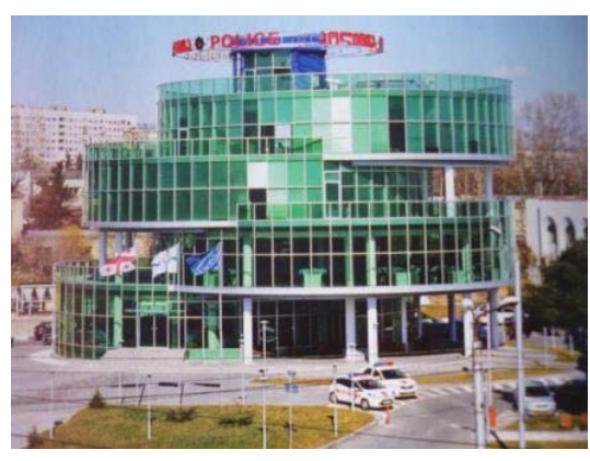
Police Station, Tbilisi