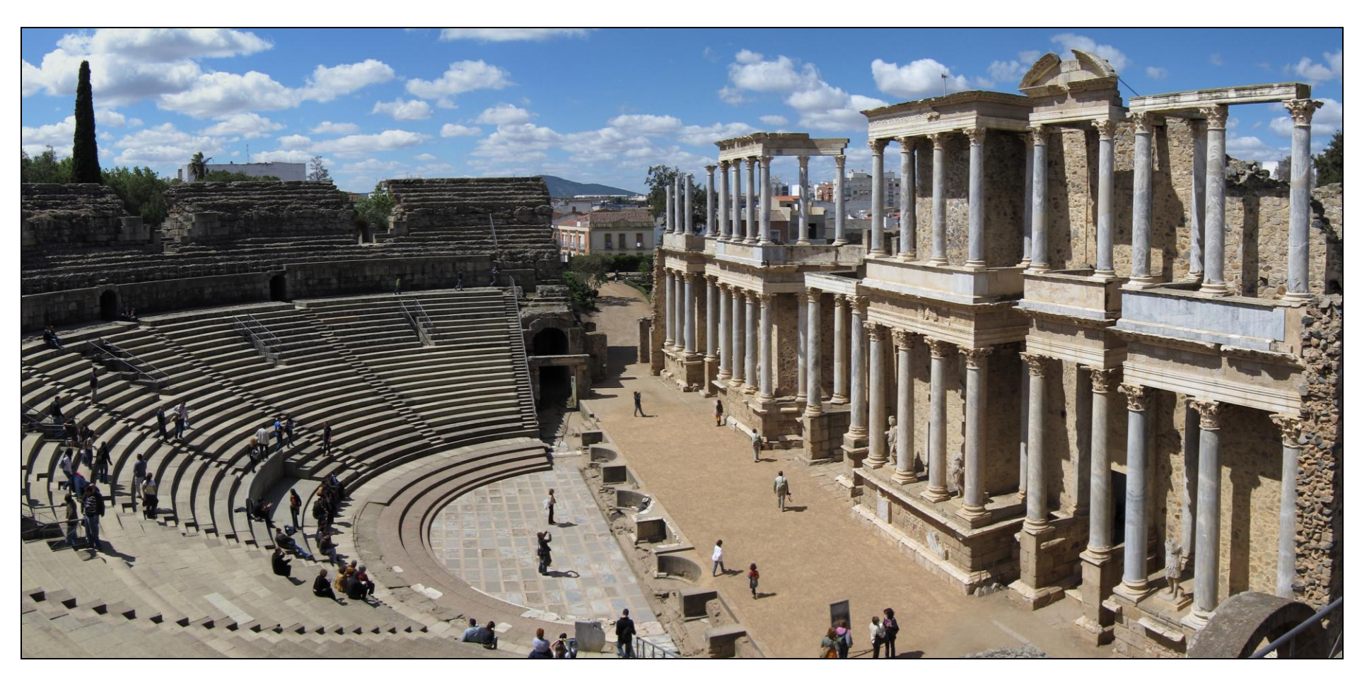
3.- Roman Theatre