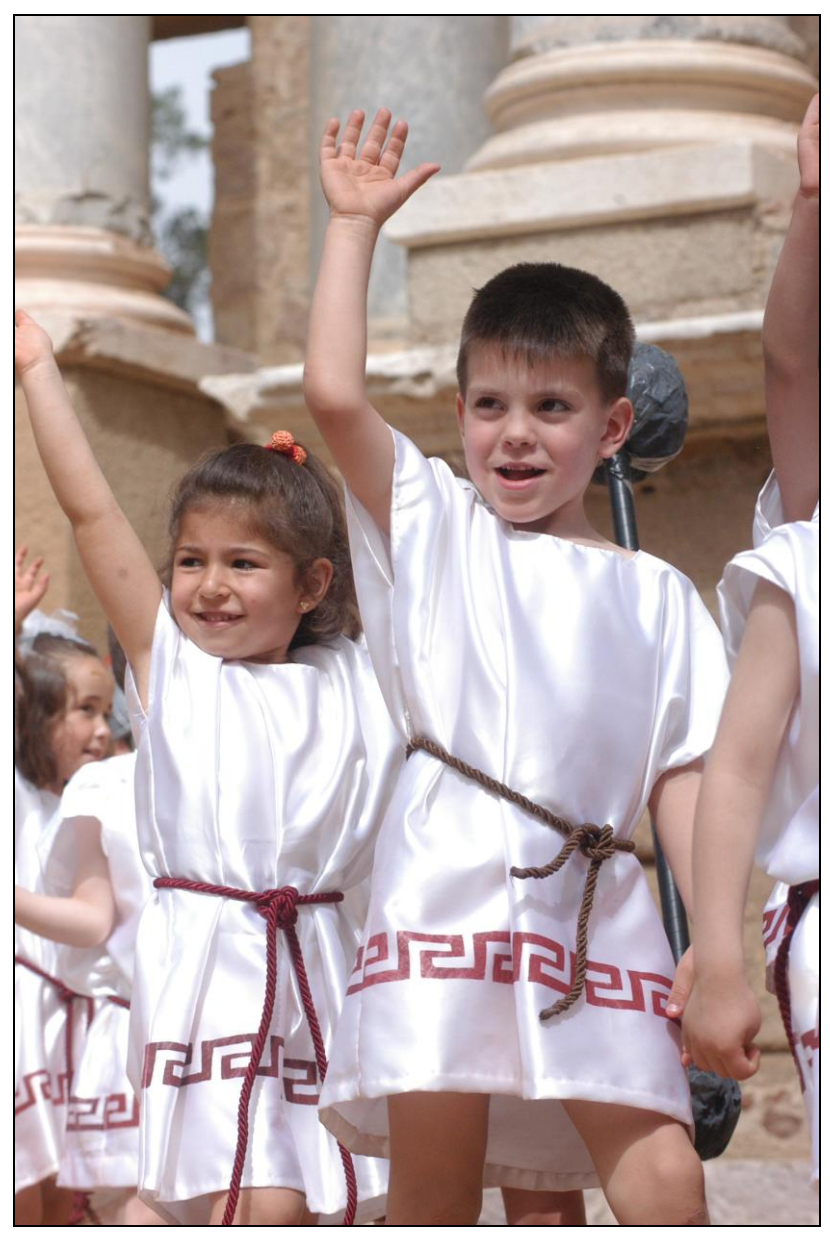
4. Theatrical performances at the Roman Theatre