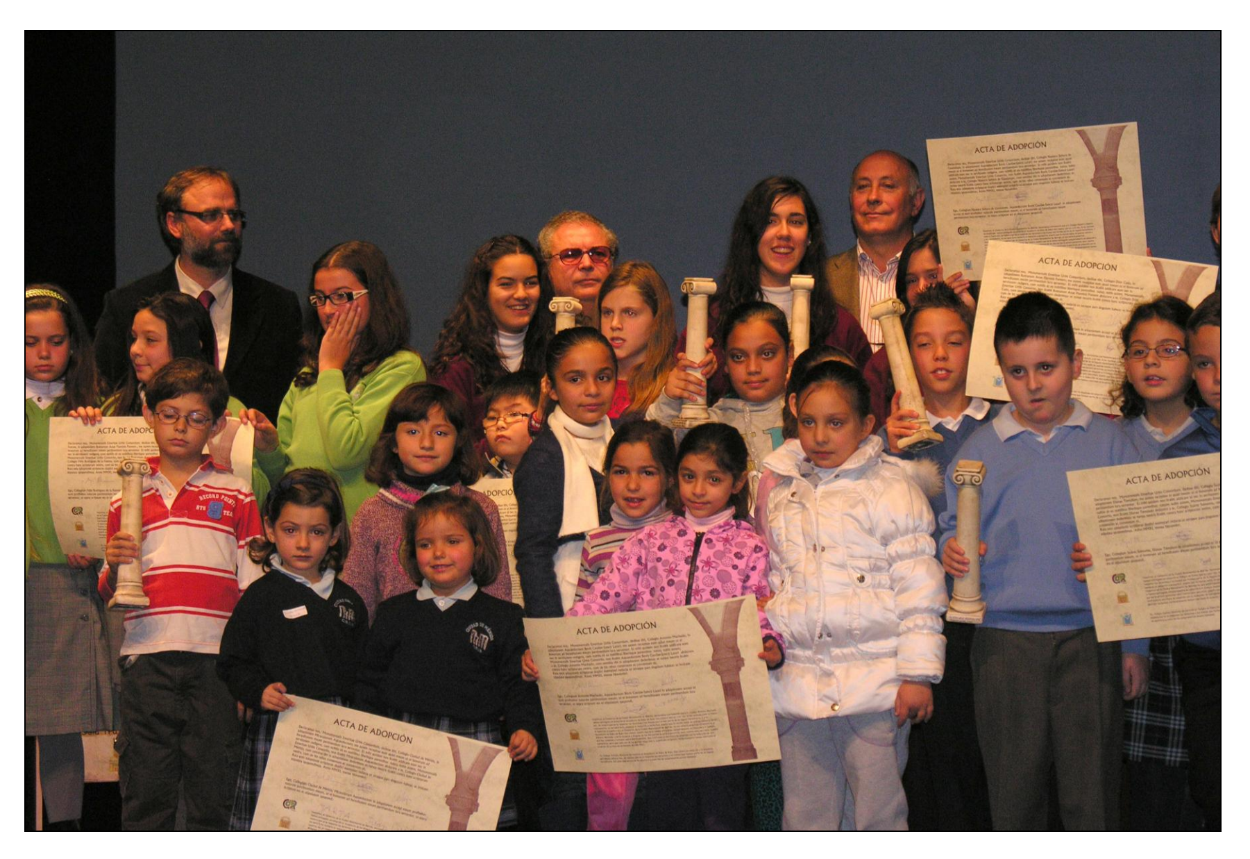
8.- Diploma ceremony of the programme "The School adopt a Monument"