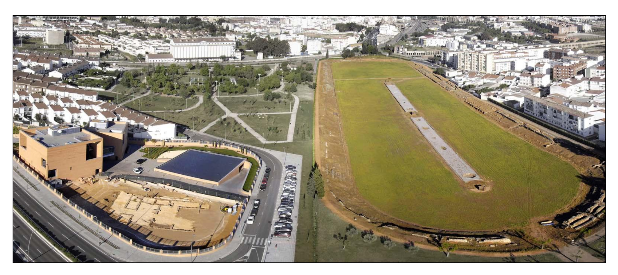
2.- Roman Circus