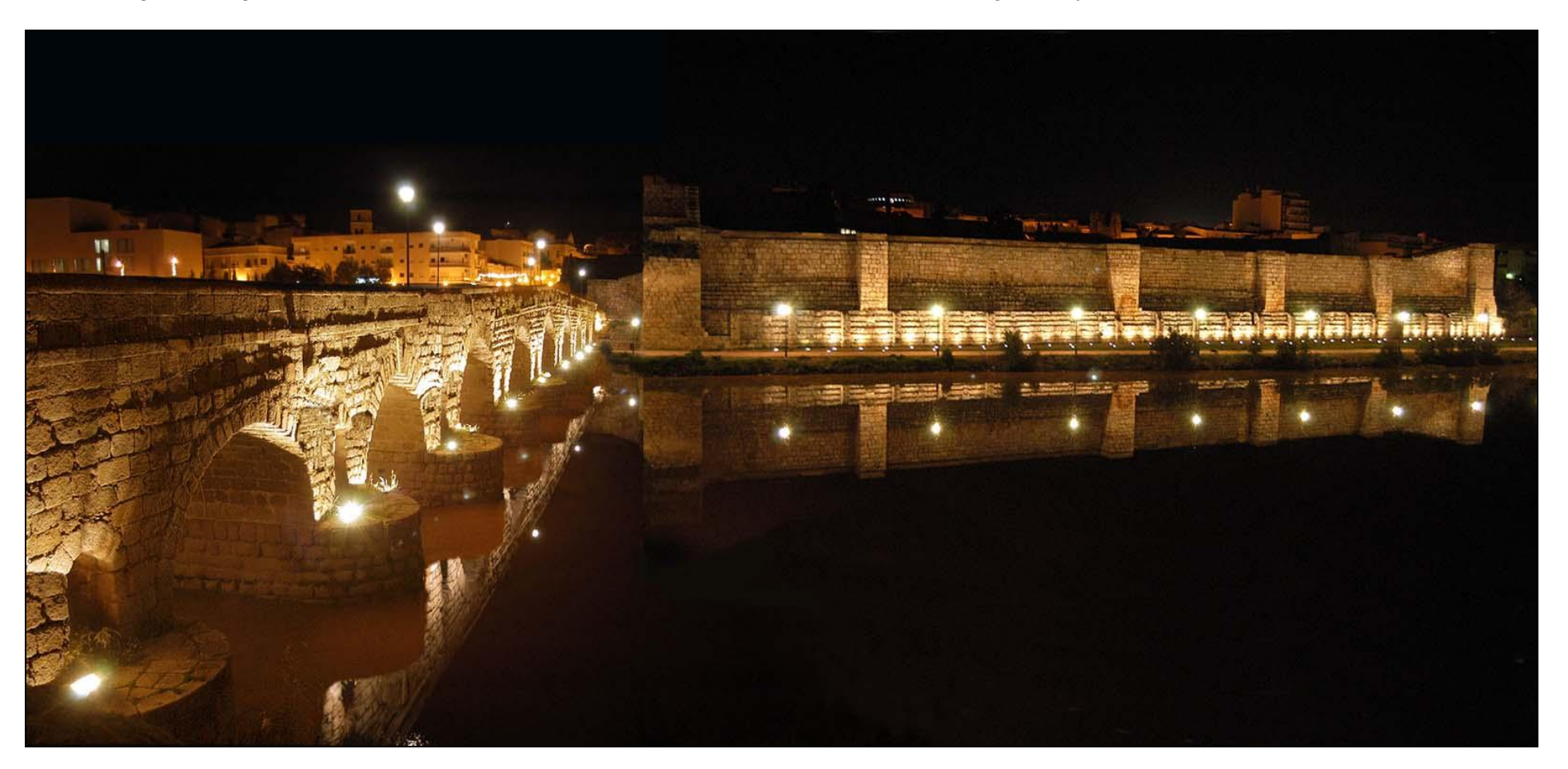
1.- Roman bridge over Guadiana River and dike of the Arabian Fortress. Night view

Note. All the images belongs to the The Consortium "Monumental, Historical-Artistic and Archaeological City of Mérida"