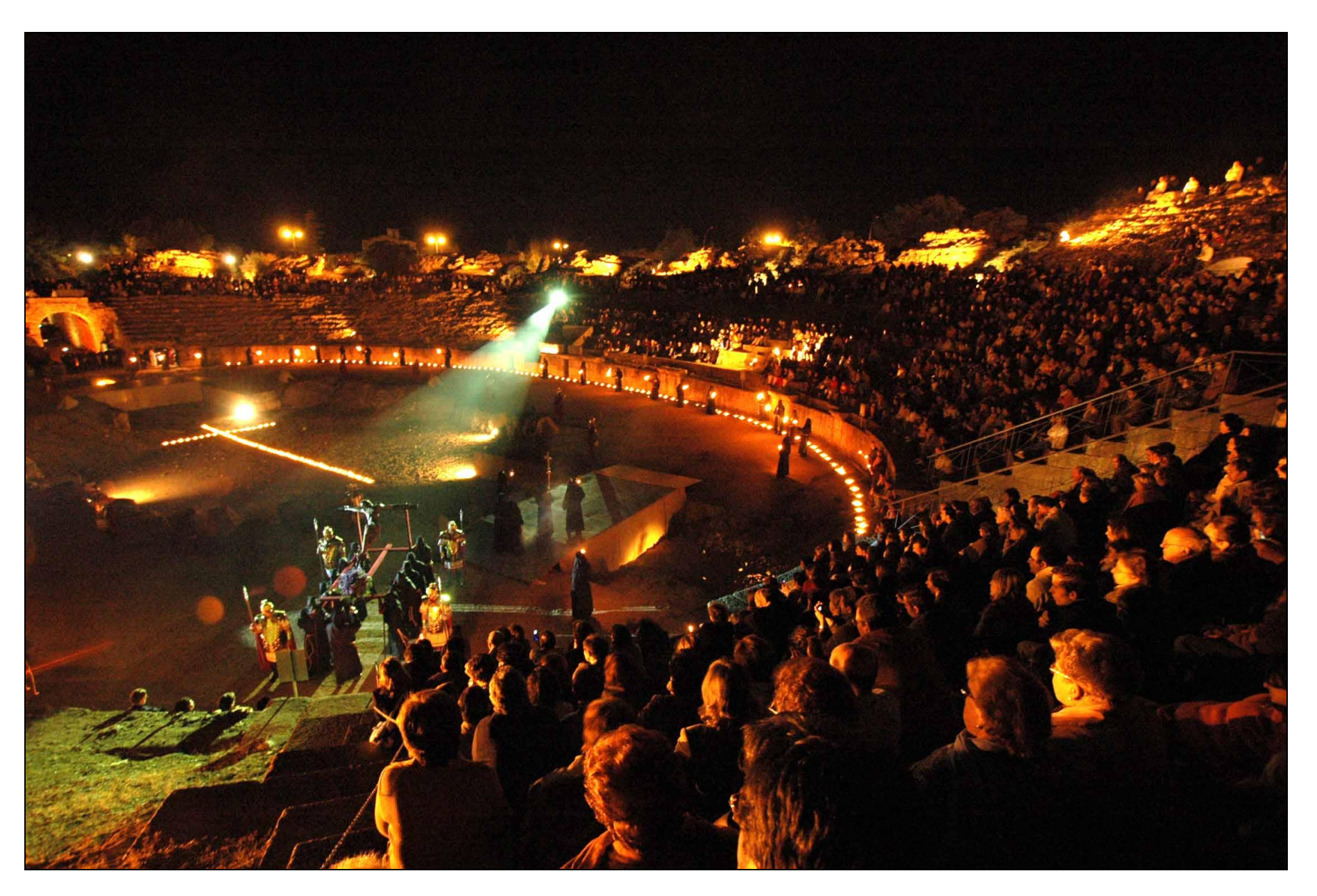
6.-Representation of the Via Crucis during the Holly Week in the Roman Amphitheathre.