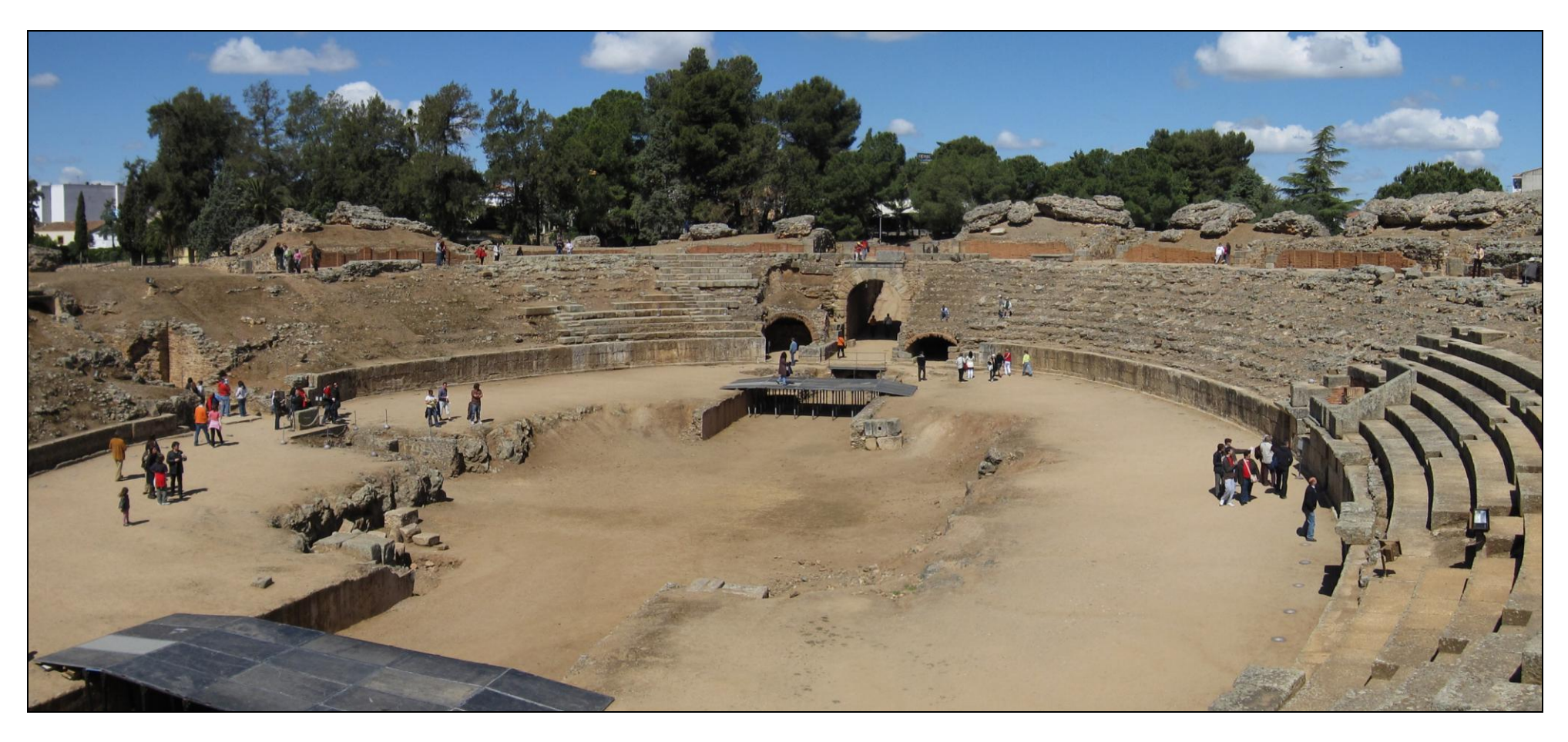
5.- Roman Amphitheatre