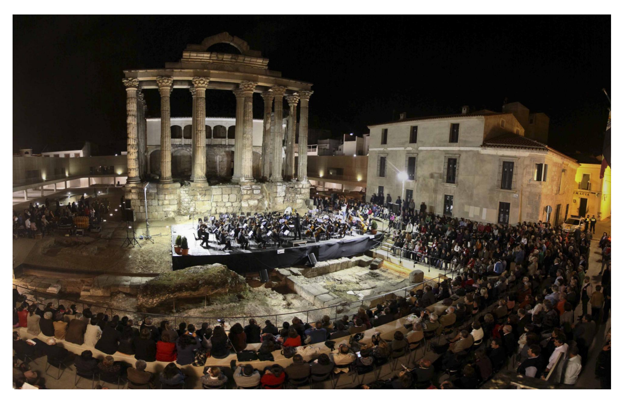
7.- Classical music concert at the Diana Temple