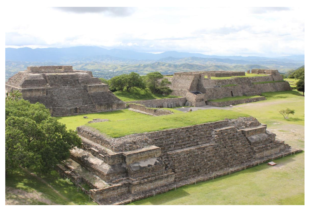
General view of the M System and L Building (Dancers). Archive of the Archaeological Site of Monte Albán: Photography: Miguel Angel Cruz González, INAH: 2011.