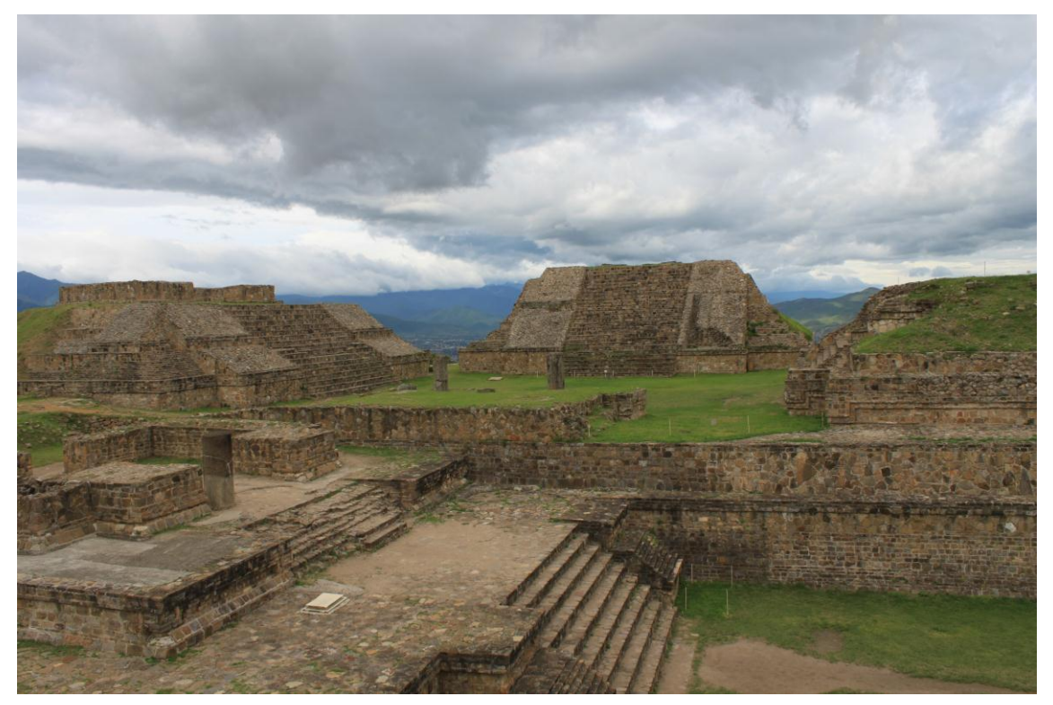
View of the VG Group, North Platform.