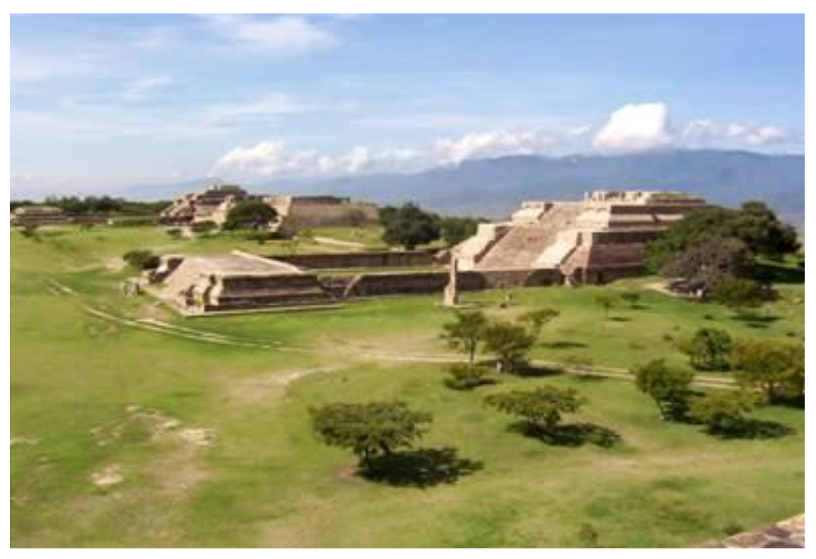
View of the System IV, Main Square.