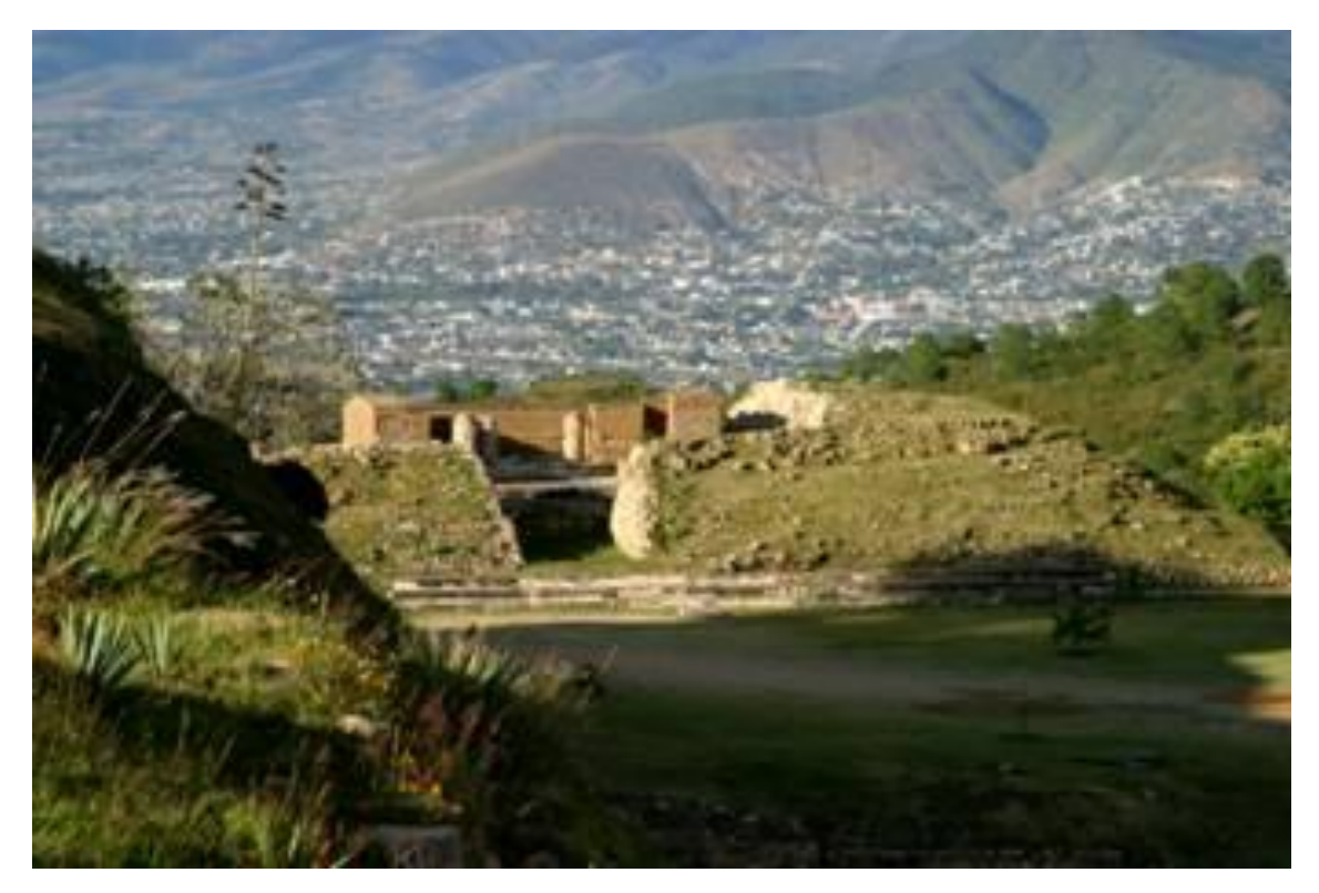
View of the X Building, Northwest end of the North Platform.