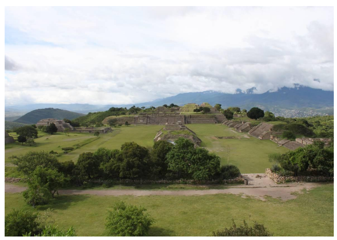
Panoramic from the South of the Main Square of Monte Albán. 2011.