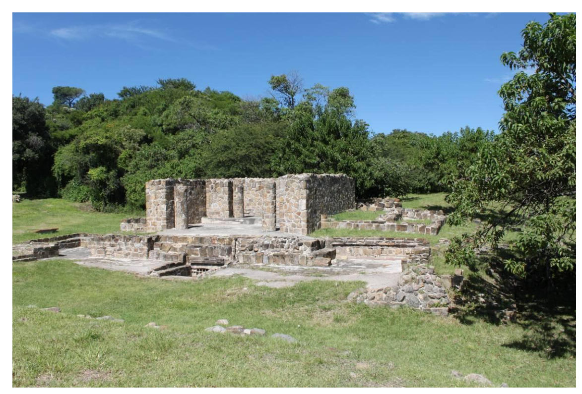
Panoramic of Tomb 7 of Monte Albán: Archive of the Archaeological Site of Monte Albán: Photography: Miguel Angel Cruz González, INAH, 2011.

Finally, please provide us, if possible, with up to ten images of the concerned World Heritage property that can be used free of rights in UNESCO publications (commercial and/or non-commercial), and on the UNESCO website. Please provide the name of the photographer and the caption along with the images (he/she will be credited for any use of the images).