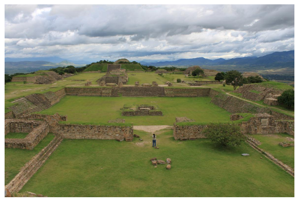
View of the Sunken Patio, North Platform and Main Square.