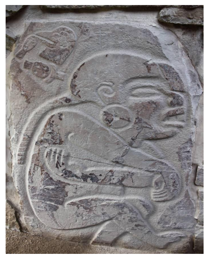
Dancer sculpture (L Building-Gallery of Dancers).