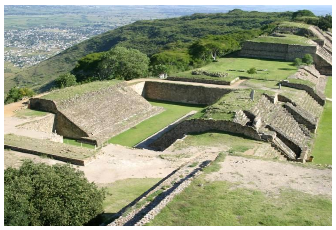
View of the Juego de Pelota, Main Square.