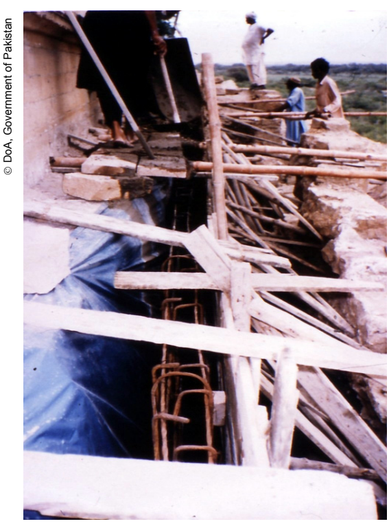
Restoration works at Thatta

An Environmental Monitoring System, photogrammetry laboratory and other surveying resources are proposed as central in to developing site-monitoring indicators.