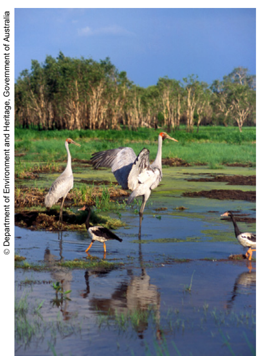
Waterbirds at Kakadu National Park

1998 WHC-CONF.202/4 IUCN informed the Ext. Bureau that its advice on the matter of the Jabluka mine was guided by the use of the precautionary principle. After hearing the views of Bureau members, the Chairperson summarised the debate as a consensus on the need to proceed according to the precautionary principle, even in the absence of complete data. The Chair emphasised that the multi-faceted environmental, cultural & legal issues relating to the conservation of the site highlighted the need for a fact-finding mission.