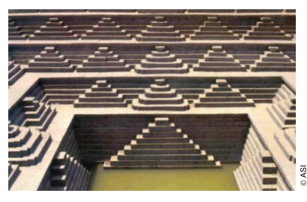
Stepped Tank of the Royal Centre

Role of the inscription to the List of World Heritage: increased tourist volume, increased general awareness after in danger listing, people cooperate better with the authorities and boost to international research programmes.