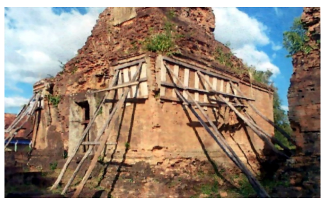
Proping of the Bakong Temple