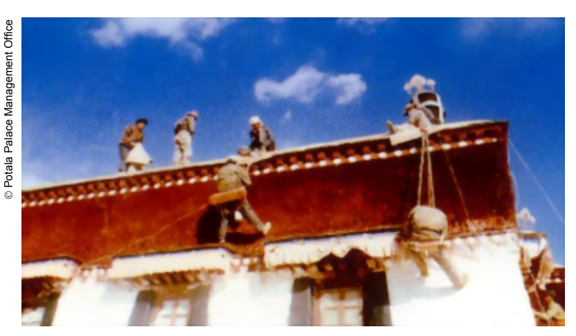
Yearly application of earthen materials outside the walls of the Potala Palace

1999 Bureau, WHC-99/CONF.204//5 - On April 1999, the Centre once again requested the authorities for information concerning the possible extension of this site. To date, no additional information has been received. The Secretariat may briefly report to the Bureau on the progress made in extending this property, if the nomination is submitted by 1 July 1999.