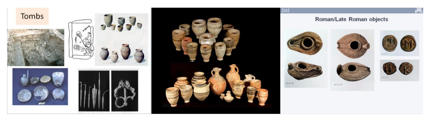
Examples of artefacts included in the presentations of the representatives from the foreign archaeological missions.

Finally, the expert from the University of Bern presented on the issue of illicit trafficking of cultural property through the diplomatic pouch: according to his presentation, it is common that some diplomats collect cultural objects from their country of assignment; this leads to the creation of large collections of antiquities, which do not always undergo through control by the customs. These collections can later be introduced lawfully into the art market, if sold, or could become part of museum collections, if donated. Therefore, in order to reduce the problem, civil servants working abroad should be asked export certificates in order to send out cultural objects; also, artefacts without searched provenance should not be accepted by sellers and museums. It featured later in the discussion that the illegal export of cultural property does not only concern diplomats, and that there is a general lack of awareness among international visitors to the countries rich in heritage. Later during the workshop the Swiss expert also presented on a project in Gaza, a case of archaeological work under the circumstances of a conflict. Activities there included not only research, but also awareness and capacity building, aimed also at solving issues with artefacts without certified origin.