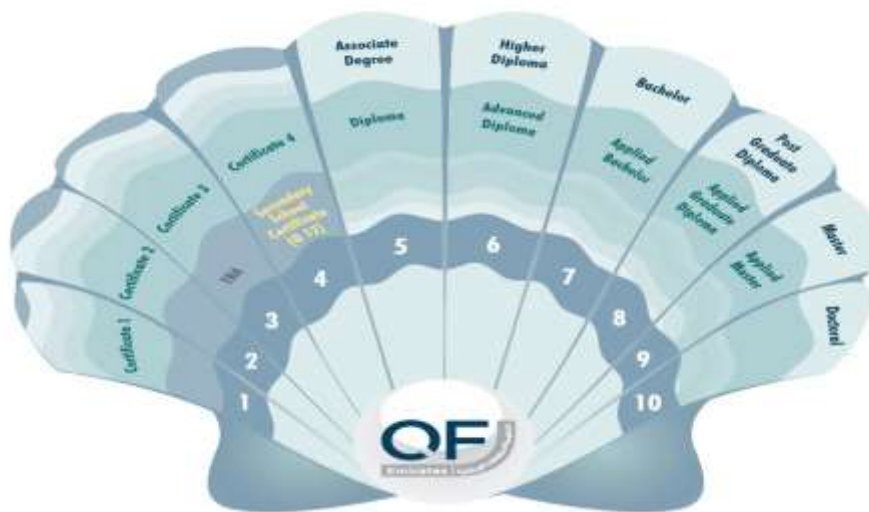
Qualifications Framework for the United Arab Emirates (QFEmirates)