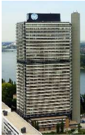
UN Campus Hermann-Ehlers-Str. 10 53113 Bonn, Germany 25th Floor

UNESCO's International Centre for Technical and Vocational Education and Training ("UNESCO-UNEVOC") is located as follows: