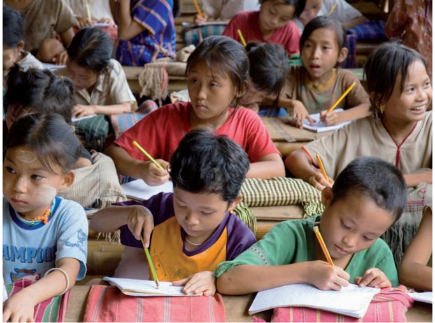
In Thailand, the curriculum for refugees from Myanmar has recently been aligned with the Thai curriculum.

Validating learning should be an early priority in an emergency response and should be sustained after crisis