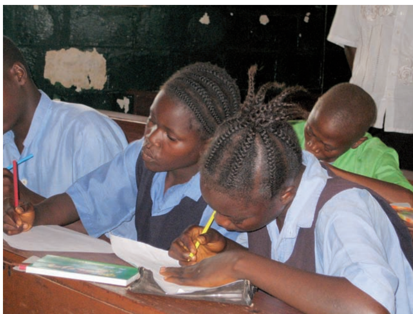
Liberian students prepare for a West African Examinations Council (WAEC) exam.

Knowing that their studies will be recognized is a strong motivation for students. It contributes to individual, family and community well-being and provides realistic employment opportunities. Furthermore, certification of learning can improve the social and economic contributions of refugees and IDPs to their host and home areas, as it provides a pathway to active participation in society.