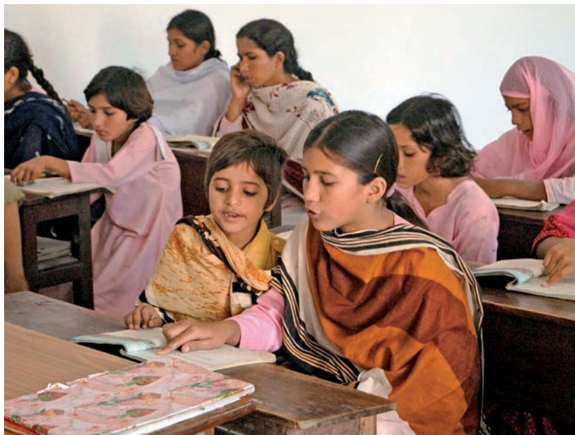
The Afghan consulate certifies the learning for refugees in Pakistan.

Donors should assist in breaking down the financial barriers which limit refugee access to examinations (such as fees and travel to examination sites). However, this assistance must not jeopardize relationships with the local community.