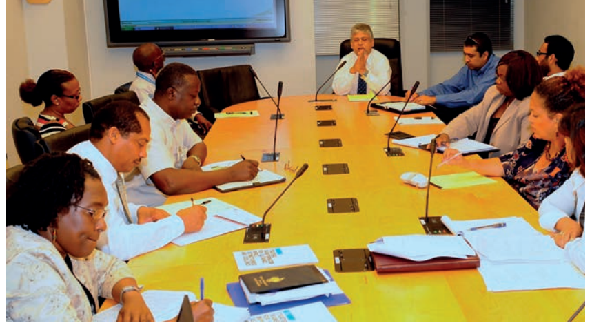
Meeting with heads of administrative units at UWI

The overriding dilemma is the complex array of forces that need to make wealth generation and development happen in any national context. Tertiary education alone will not make development happen; but development in the knowledge era cannot happen without tertiary education. A sustainable tertiary education system is a necessity in a small state for that state and its citizens to participate in and benefit from the global knowledge economy. Yet one needs a thriving economy to generate the wealth necessary to fund a tertiary system sustainably. This will be a continuing dilemma which small states will have to resolve with creativity, enterprise, and innovative solutions.