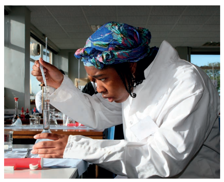
A student doing lab work in a chemistry class

growth and diversification to absorb that throughput or else migration may become an issue, loan repayments can become a problem, and the graduate tax be undermined.