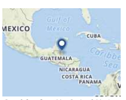
Data © OpenStreetMap Design © Mapbox

Population: 359,000 (2015) Youth population<sup>1</sup>: 74,000 (2015) Median population age: 23.5 (2015) Annual population growth (2010–2015)<sup>2</sup>: