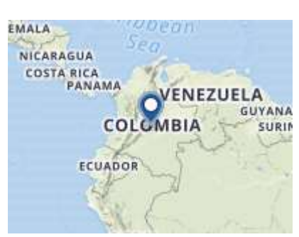
Data © OpenStreetMap Design © Mapbox

48,229,000 (2015) 8,268,000 (2015) 30.0 (2015) 0.98%