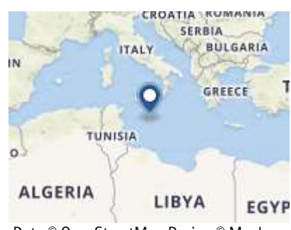
Data © OpenStreetMap Design © Mapbox

419,000 (2015) 54,000 (2015) 41.5 (2015) 0.32%