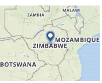
Data © OpenStreetMap Design © Mapbox

Population: 15,603,000 (2015) Youth population<sup>1</sup>: 3,262,000 (2015) Median population age: 18.9 (2015) Annual population growth (2010–2015)<sup>2</sup>: