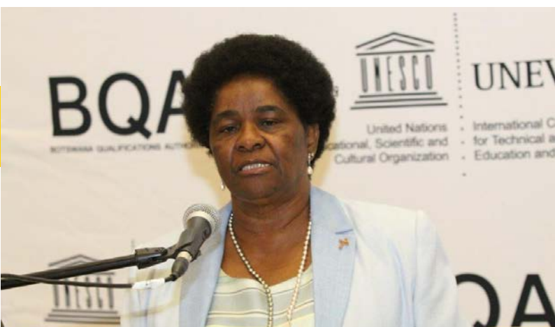
Minister H.E. Pelonomi Venson-Moitoi

National policies and curricula, including TVET curricula, need to be aligned with and correspond to the actual conditions and needs young people face in urban and rural areas, providing them with relevant (TVET) skills, that respond to their individual, social and labour market needs and thus ensure a better transition from education to work!