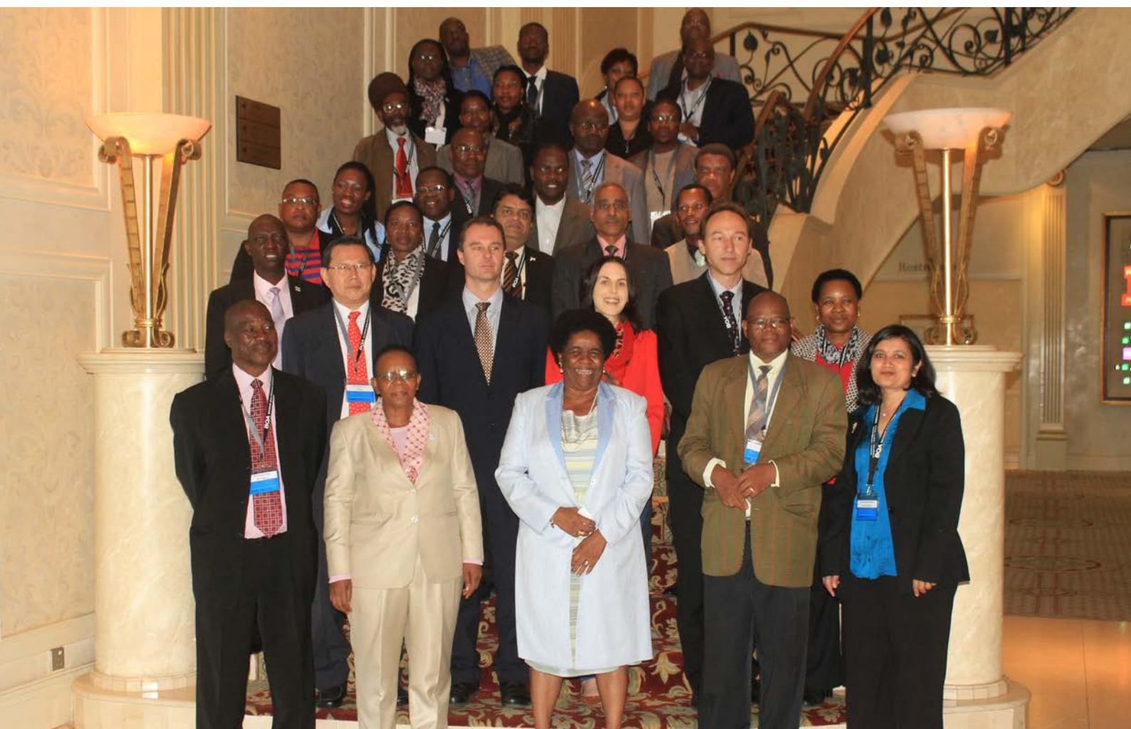
Participants of the workshop