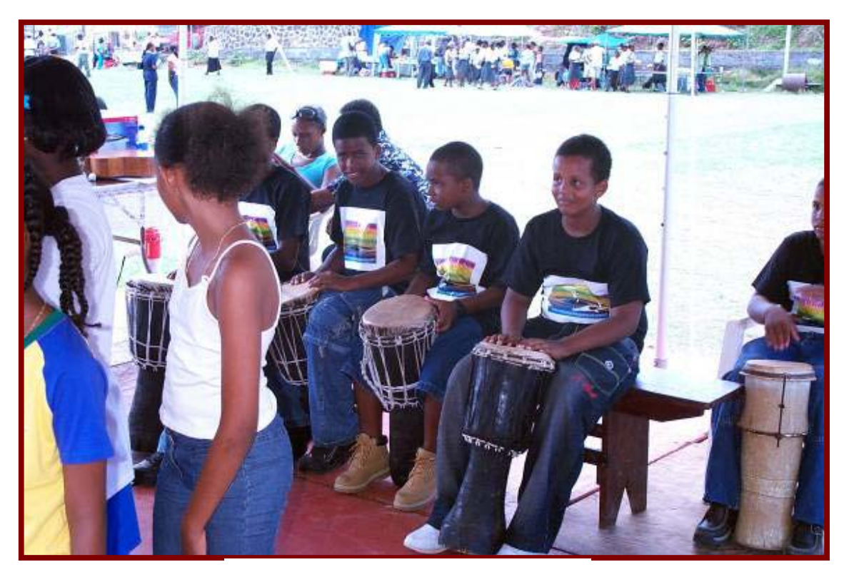
Music by R.I.P.P.L.E.S.