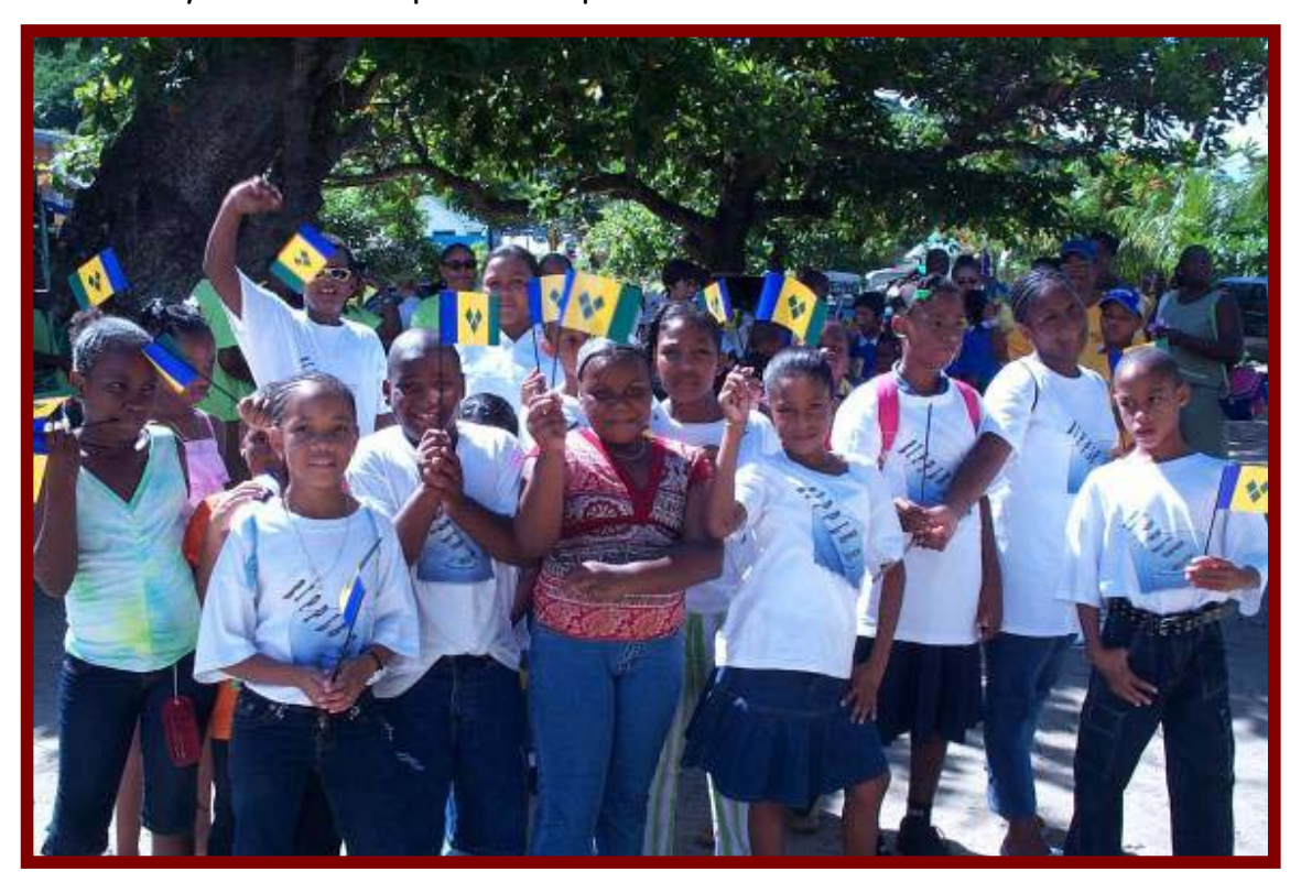
R.I.P.P.L.E.S. assembling for 27<sup>th</sup> Independence Parade

It was a little disappointing that the group had to forgo the performance of another cultural piece which they had been looking forward to (because of the late start) but the day was a memorable one. The 27^{th} anniversary of independence was blessed with beautiful weather under blue skies. Lots of children turned out for what is hoped will be an annual event, with fun, music and games in the wide open space where memories are made and a sense of community and national pride is experienced.