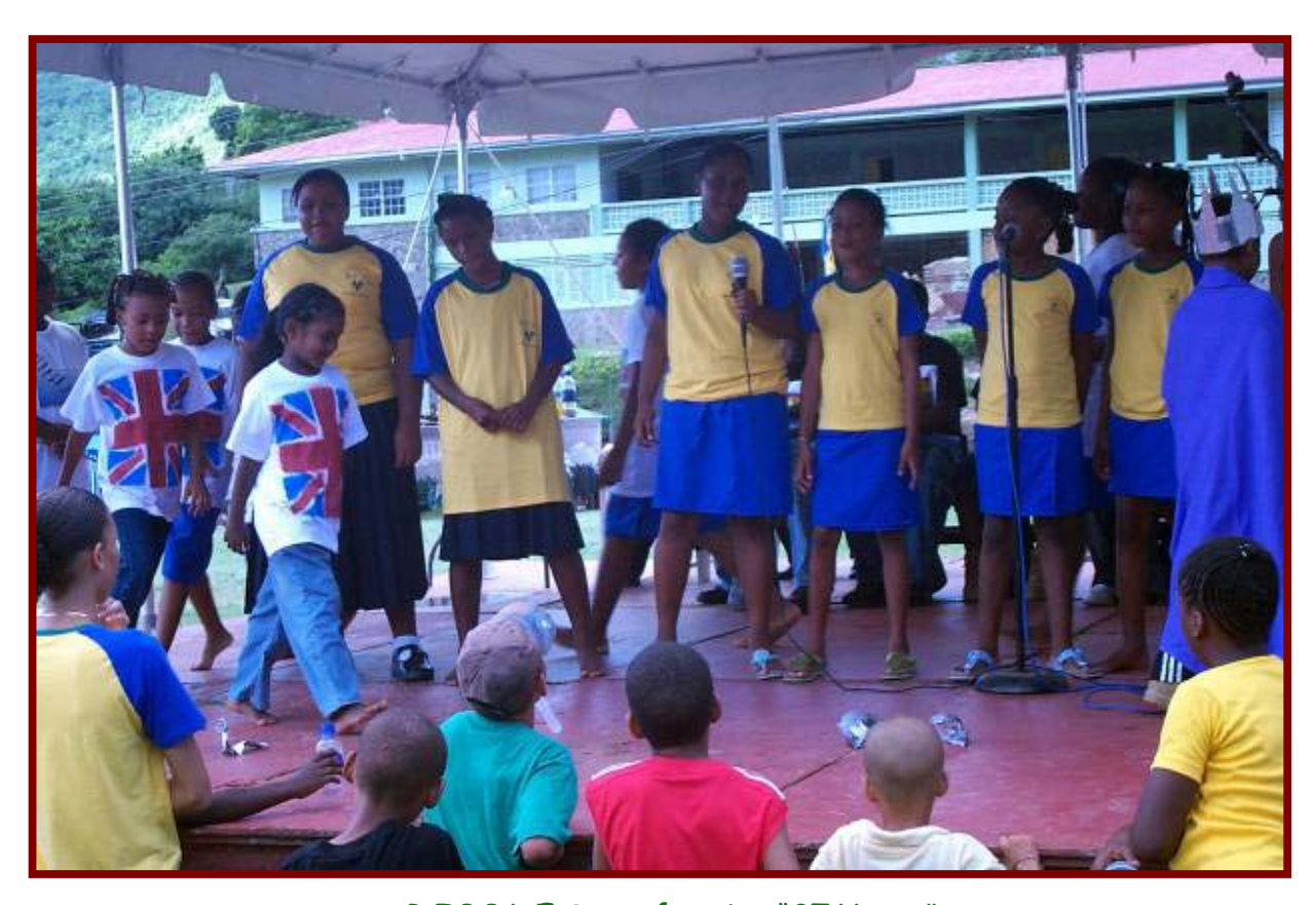
R.I.P.P.L.E.S. performing "27 Years"