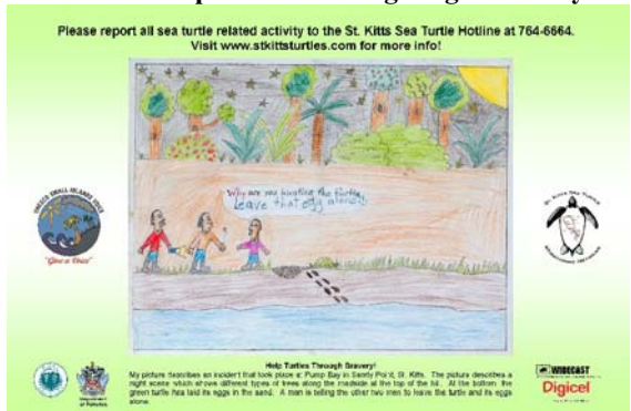
Poster Competition - Winning Poster