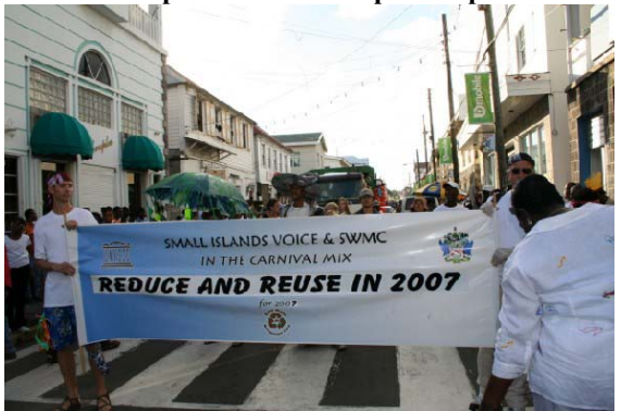
"Clean-Up" Carnival Troupe