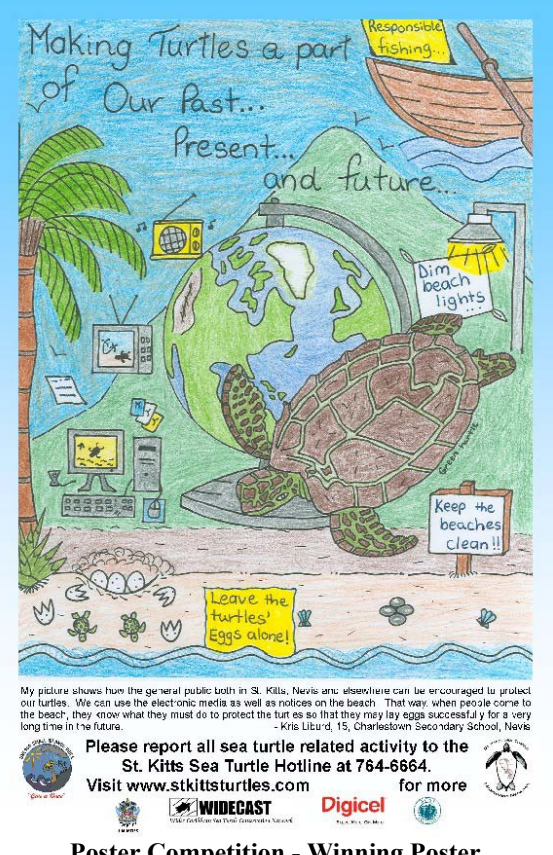
Poster Competition - Winning Poster