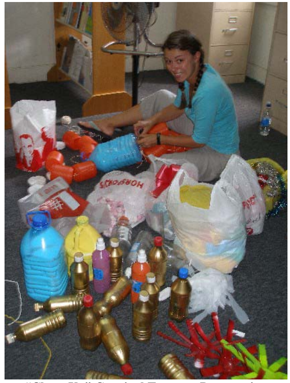
"Clean-Up" Carnival Troupe - Preparation