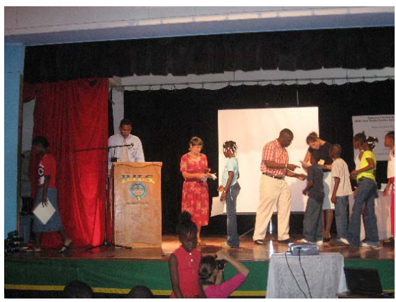
Poster Competition - Prize giving ceremony