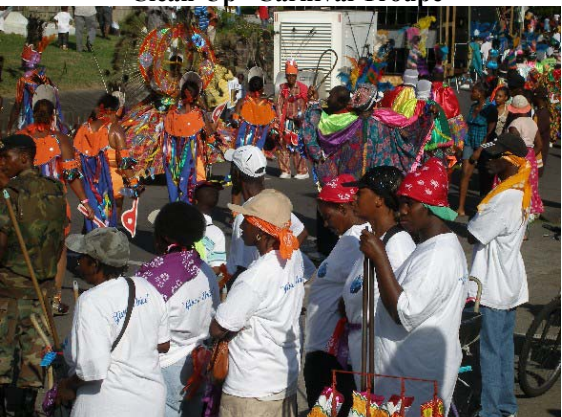
"Clean-Up" Carnival Troupe