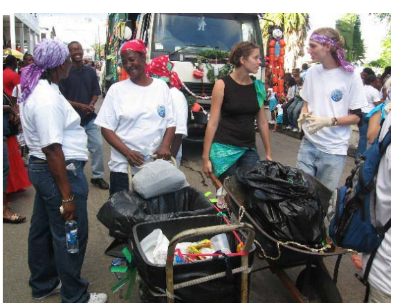
"Clean-Up" Carnival Troupe