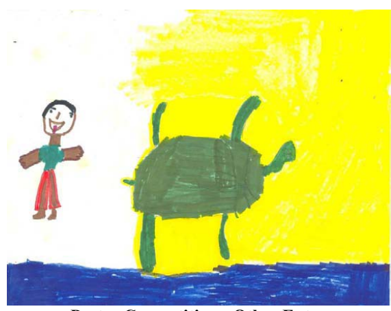
Poster Competition - Other Entry