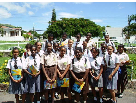
"Back chat" students