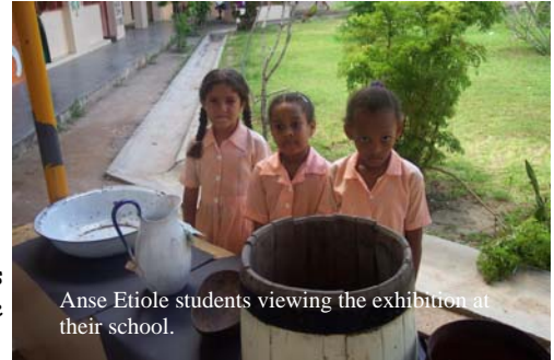
Anse Etoile students viewing the exhibition at their school.

Three competitions were also organised at Anse Etoile school to commemorate World Day for Water, these were quiz, public speaking and posters. Students and staff