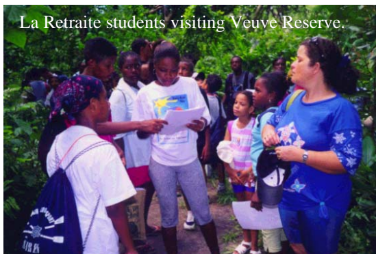
La Retraite students visiting Veuve Reserve.

You will also be able to read about two new interesting environmental education programmes which have been initiated for school children. While