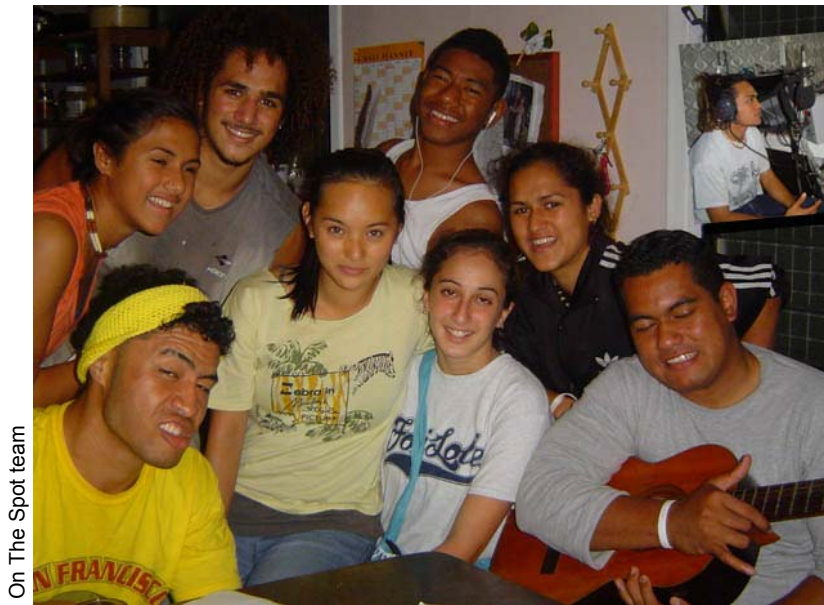
On The Spot team