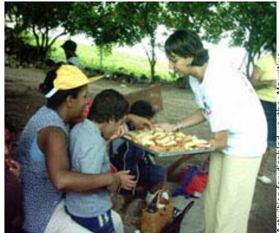
Activities for disabled youths, Mauritius