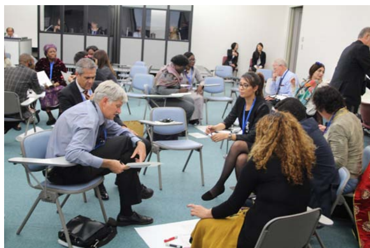
Participants at the workshop, Nagoya, Japan

This is true especially regarding the rural-urban flows which place urban infrastructures under strain.