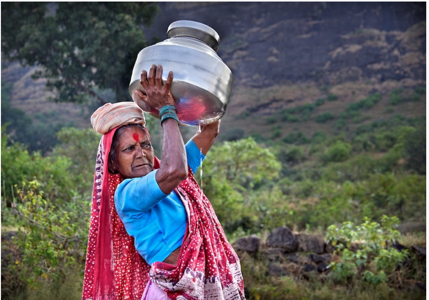
Methgharkila village, Maharashtra, India. Relief is coming in the form of a water tower for the village.

The GAP is global and multidisciplinary in nature, aiming to include all sorts of stakeholders, regardless of their influence or power. It is our best plan of action to conduct the desirable systemic changes necessary to build the future we want.