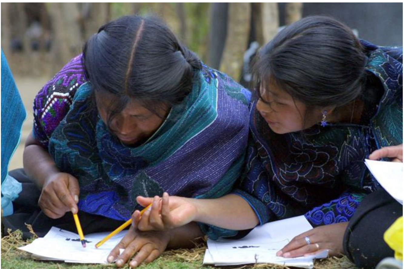
Women in Chiapas, Mexico

The GAP on ESD has five priority areas: (1) advancing policy to mainstream ESD into both education and sustainable development practices; (2) transforming learning and training environments to integrate sustainability principles into their settings; (3) building capacities of educators and trainers to more effectively deliver ESD; (4) empowering and mobilizing youth to act for sustainable development and disseminate practices that sustain ESD; and (5) accelerating sustainable solutions at the local level, engaging communities, stakeholders and media professionals. These priority areas were central to the structure and development of the workshop “Water Education and Capacity Building: Key for Water Security and Sustainable Development”.