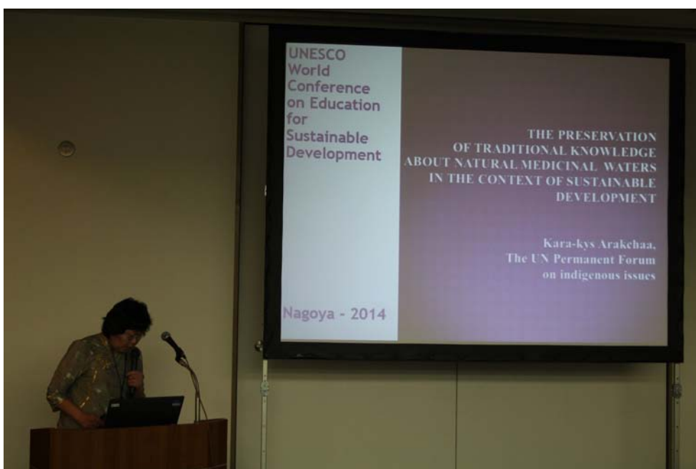
Presentation on the importance of considering indigenous knowledge in water education, Nagoya, Japan

Other suggestions were given, such as creating economic incentives to decrease the consumption of energy and water. For example, higher taxes could be charged on the consumption of energy at night, so people see in numbers and money the impact of their standards on the use of resources. Though this method is less successful in raising one's awareness of the importance of acting sustainably, it can be a successful starting measure that will initially change the way people act and cause positive change. Awareness, values and knowledge can then follow.