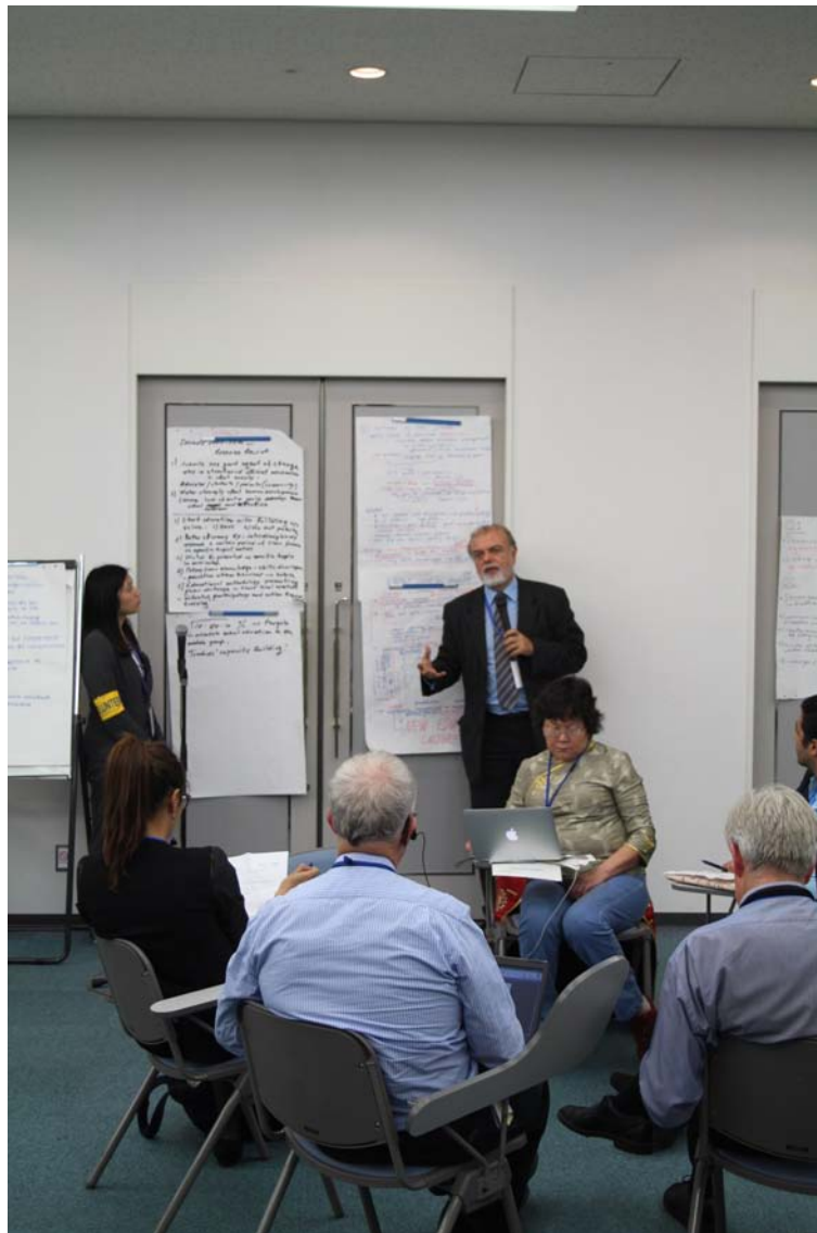
Roundtables on Water Education, Nagoya, Japan