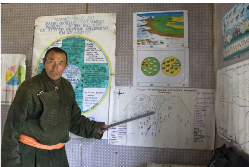
Mongolian Herders Practice Sustainable Resource Management

As part of the preparations for the GAP, the UNESCO World Conference on Education for Sustainable Development was held from 10 to 12 November 2014 in Aichi-Nagoya, Japan. Among its objectives, the conference aimed to assess the current status of ESD and discuss future actions, which address the priority action areas of the GAP. In the case of water, the GAP priority action areas are interconnected with the objectives of the eighth phase of the International Hydrological Programme (IHP-VIII, 2014-2021), targeted at improving water security in response to local, regional, and global challenges. The current report is based on the main outcomes of the Conference workshop on "Water Education and Capacity Building: Key for Water Security and Sustainable Development" coordinated by the UNESCO International Hydrological Programme (IHP) and the UNESCO Chair on Water, Women and Decision-making in Morocco. The conclusions of these processes, several of which are shared in this publication, can provide a valuable perspective on how to advance water education and capacity building as critical instruments to reach water security and sustainable development.