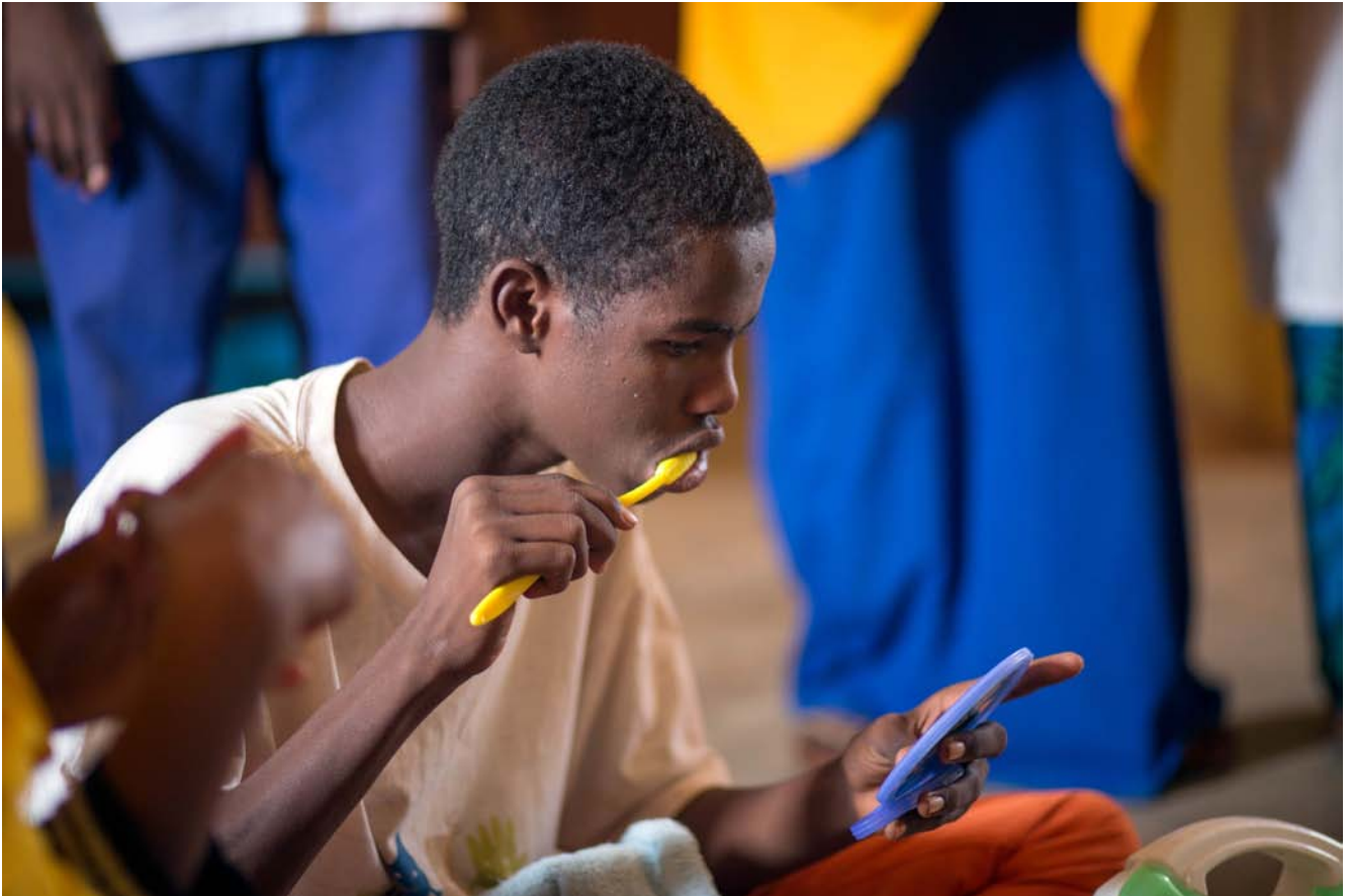
Students perform a drama demonstrating the importance of sanitation at school in Ethiopia

7. a) Decision-makers, water technicians, communities, stakeholders and mass-media professionals should receive and subsequently promote ESD. They are an integral part of water management; they consist of the main actors who communicate about water issues; they influence the public and form opinions; and they have a special interest in water consumption or deal with water issues as their profession. Therefore, they need to develop and spread sustainable values and practices. Even if their knowledge is often technical, they also need to consider water in its many relations and under many disciplines. They too must be empowered with sustainable knowledge if the goals of ESD are to be fulfilled. In addition, many of them are in a position to disseminate ESD values and practices, being further catalysers of ESD. Sustainable ideas can be communicated to families by children, media, etc. For the media, advertisements explaining these issues could be broadcast. The advertisements could be conceived by volunteers with government support – focusing on the importance of conserving water, not polluting, etc. The private sector could also be involved in the make-up of devices that contribute to sustainability and sanitation and use their innovation to embrace sustainable values, while still making a profit.