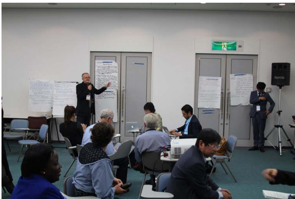
Participants during the workshop, Nagoya, Japan

However, it was found that the current education systems do not dedicate due importance to the resource. In fact, the beginning of agriculture, and indeed evolution, was closely tied to water. There are successful examples of co-management of the resource through customary law, in places where it is scarce (such as semi-desert oasis locations in North Africa), illustrating the importance of cooperation to achieve a sustainable use of the resource. This approach, however, does not work in modern states, where economic issues, elites, power gradients and external policies define how water is supplied, distributed and managed, all of which can also result in conflict.