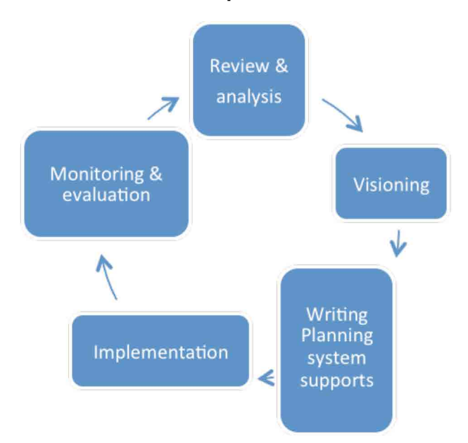
Figure 1: Phases of curriculum development and review

Prior to the initiation of a curriculum development or review process, educational authorities will have agreed that there is a need to reform EDC/HRE curriculum policy. The rationale for such an effort can vary. It may be that EDC/HRE syllabi and textbooks are reviewed as part of a normal cycle organised by educational authorities. There may be "triggering events" such as low-quality performances of students in comparative citizenship education studies, such as the International Association for the Evaluation of Educational Achievement (IEA) or International Civic and Citizenship Education Study (ICCS), 10 or other studies that show a low level of civic knowledge, attitudes and behaviours. It can also be that events external to the education sector, such as socio-economic contexts, new political leadership or a cross-sector action plan on children and young people, may warrant revisiting not only the EDC/HRE-related syllabi, but their broader framework and aims. Other local factors that will