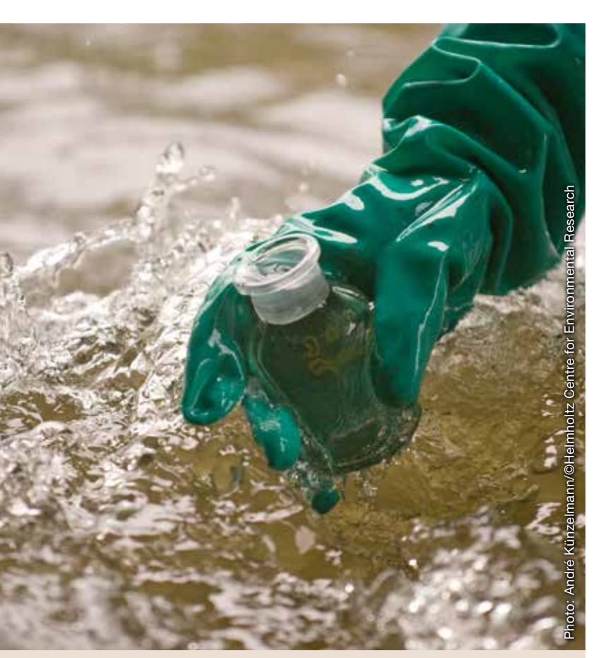
Sample-taking at the Bílina River (Ústí nad Labem Region, Czech Republic)