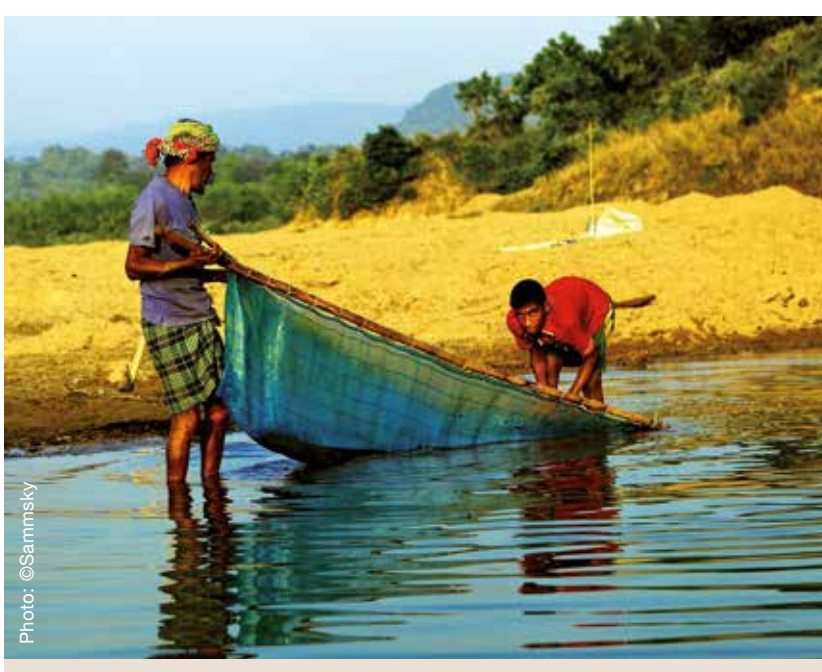
Coal Fishing (Jaintiapur, Sylhet, Bangladesh)

The ecosystem approach puts people and their natural resources use at the centre of the decisionmaking framework, while also recognizing the need to safeguard the integrity of the natural environment (Masundire, 2003).5 This approach extends biodiversity management beyond biodiversity conservation, and can be adopted by both public and private entities involved in the regulation or management of human uses of the environment, since it engages the widest range of sectoral interests (Smith and Maltby, 2003). The complexities and intricacies of ecosystems require an integrated approach that involves all sectors. Inter-sectoral and cross-sectoral cooperation will be greatly enhanced and strengthened by an integrated architecture in the design and