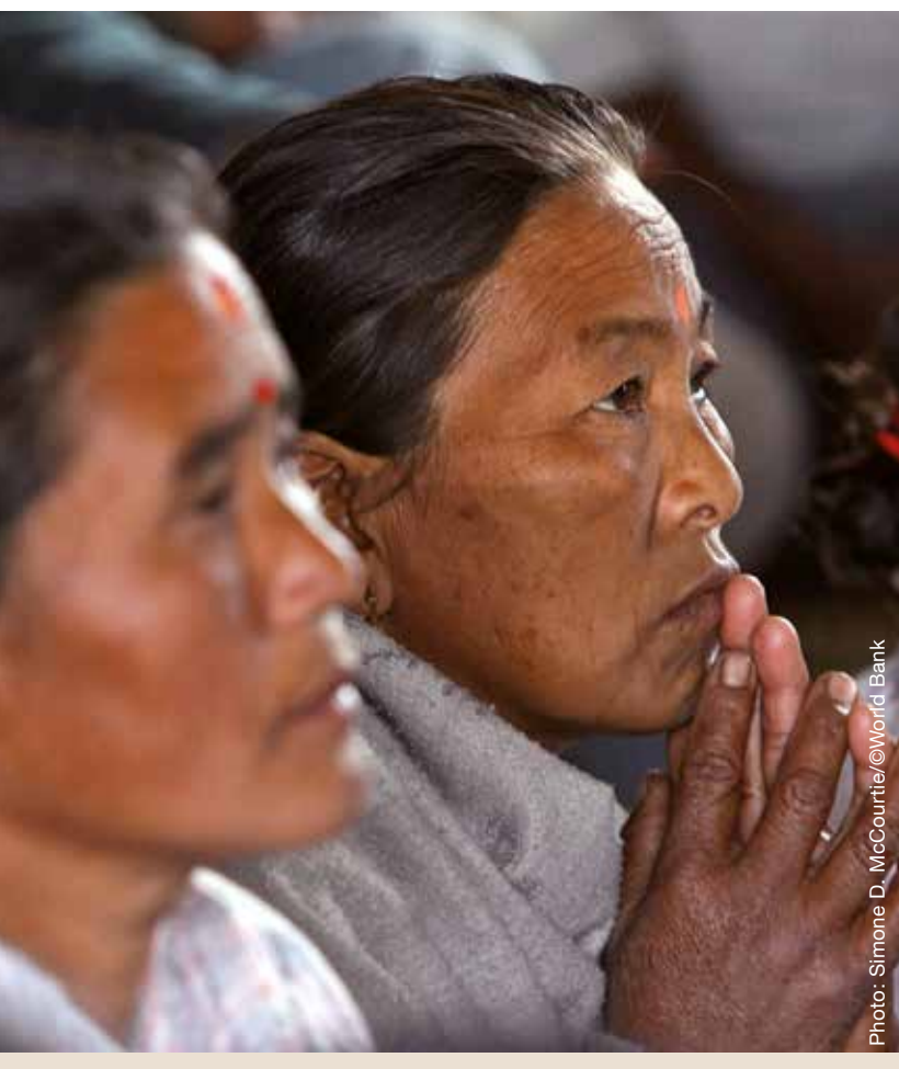
Women speak about Water Supply and Sanitation program in Nepal (Pokhara, Nepal)

RBOs can be described as specialized organizations set up by political authorities to deal with water resource management issues at the level of river basins, lake basins or across aquifers, ideally in an integrated manner.<sup>6</sup> Many types of RBOs exist, and RBOs have a wide range of functions, from playing an advisory role in support of government decision-making to constituting an overarching, supranational authority that has supreme power to make decisions in relation to river basin planning, management, development and protection. Table 1 provides an overview of the most common forms of institutional arrangements for water governance.