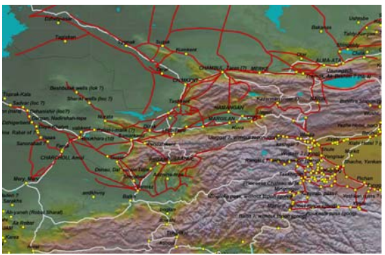
Central Asia - On-going work – Towards a caravan roads synthesis from different proposals : White roads. Red roads

Although caravanserais (and related objects, such as bridges and water points, etc.) could be considered as spatiotemporal markers for most caravan routes,<sup>10</sup> this GIS also provides an accurate reconstruction of the itineraries and precise course of the routes.