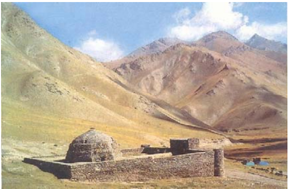
Caravanserai Tash-Rabat - Altitude : 3000 m - Kyrgyzstan

The project's first phase has served to mobilize a network of scientific teams in eight countries,<sup>7</sup> to gather a great deal of information and to outline a framework and working methods.