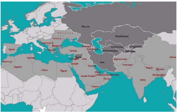
Map of countries concerned by caravanserais. In dark grey, countries currently participating in the UNESCO Inventory

Although the inventory's geographical area mainly concerns Central Asia, other areas involved: are also Eurasia. regions bordering the Mediterranean basin, the Middle East, China and the Indian subcontinent. This area covers the network of caravan routes linking East to West (in particular the Silk Roads) and also North to South. On the whole, it coincides historically with the area of expansion of Islam.