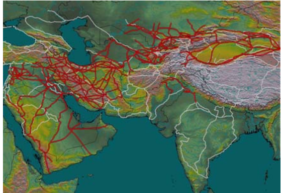
Towards a general caravanserais database and a synthesis map of caravan roads