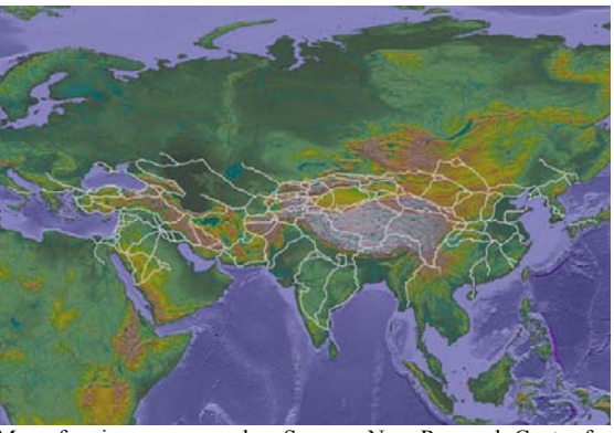
Map of main caravan roads

The need for caravanserais on these ancient trade routes between East and West (but also between North and South) is the reason they now represent, by virtue of their numbers and their architectural quality, a very valuable architectural heritage common to most of the countries concerned by the trade, a heritage that measures out the landscape at intervals equivalent to a day's journey by caravan.