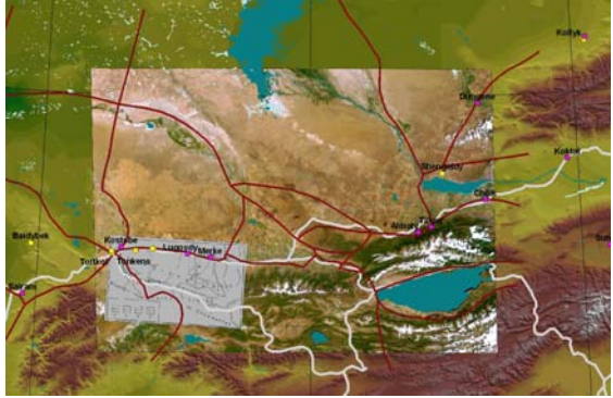
Kazakhstan – a map and satellite image are superimposed on a digital map. White roads. (Source : Nara Research Centre for Silk Roads Studies, Japan). Red roads. (Source : UNESCO Inventory)

• Through a general mapping of caravanserais and caravan routes The mapping, a crucial component of the inventory, was carried out by a geographic information system (GIS)<sup>9</sup> which mobilizes new information and communication technologies (ICTs), particularly digital cartography, satellite images and aerial photographs.