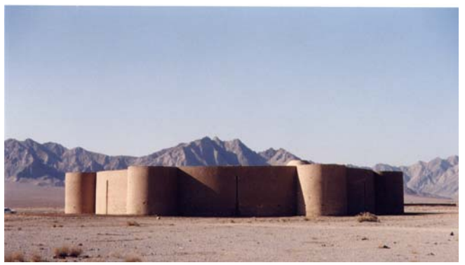
A Safavid masterpiece : Zaïn el Din caravanserai – Yazd (Iran)

These intellectual and material trading posts symbolize and bear testimony to the history and the cultural diversity of the Silk Roads.