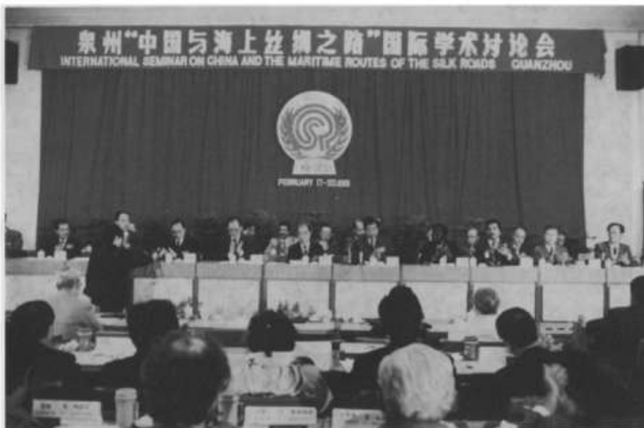
MARITIME ROUTE EXPEDITION. International seminar on 'China and the Maritime Routes of the Silk Roads', Quanzhou (China), February 1991.