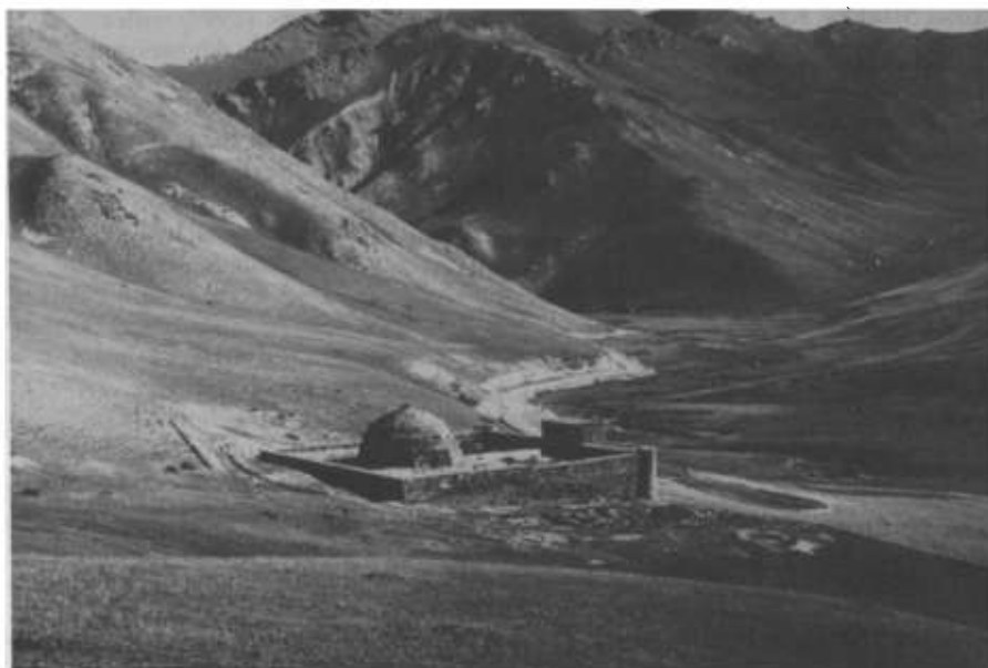
CARAVANSERAI AT TASHIRABAT (Kyrgyzstan), May 1991

A proposal was approved by the Consultative Committee to launch, in the framework of the International Research Programmes, a study on ceramics from China, Central and South-East Asia, and North Africa. It was also proposed to include a study on textiles.