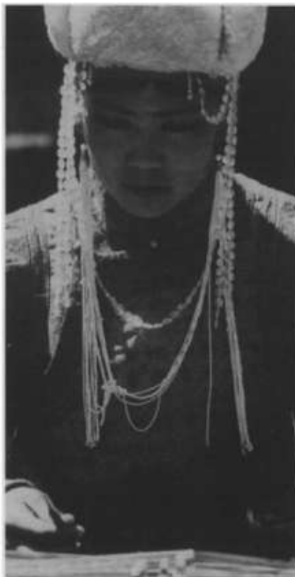
MUSICIAN FROM MONGOLIA.