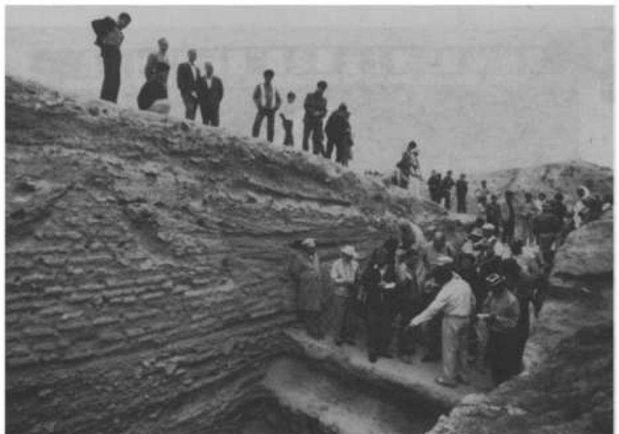
STEPPE ROUTE EXPEDITION. Work on the archaeological site of Shrakrukhiya (Uzbekistan), May 1991.

The fourth expedition followed the Nomads' Route in Mongolia in July-August 1992. An international scientific team composed of forty-four specialists from twenty-three different countries, and eleven scholars from the Academy of Sciences of Mongolia, travelled some 3000 km along the nomad trails from Khobdo in the Altai mountains, eastwards to the capital Ulan Bator. Their objective was to study in situ the civilization of the nomads of this area of the Silk Roads, known as The Empire of the Steppe , the expansion of which many centuries ago had such lasting consequences for the history of Eurasia. Twenty-eight lectures and discussions took place en route, and the team members visited some thirty-three cultural, archaeological and natural sites, monuments, monasteries and museums. The programme enabled the team to see many aspects of the traditional culture and way of life of the nomads such as music, dance, games, animal rearing, as well as the