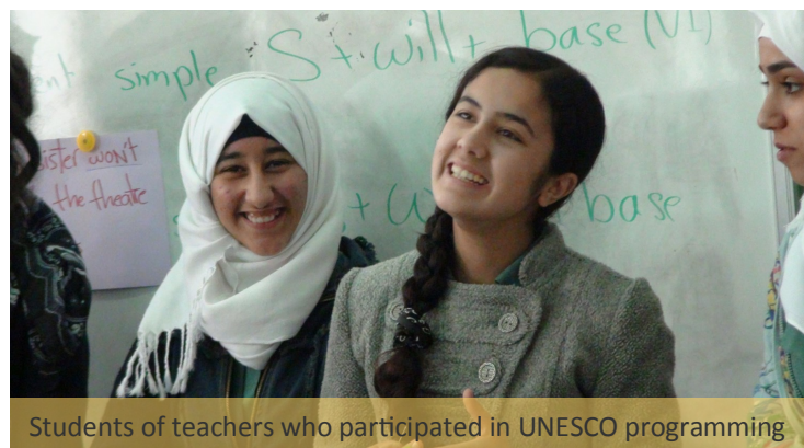
Students of teachers who participated in UNESCO programming