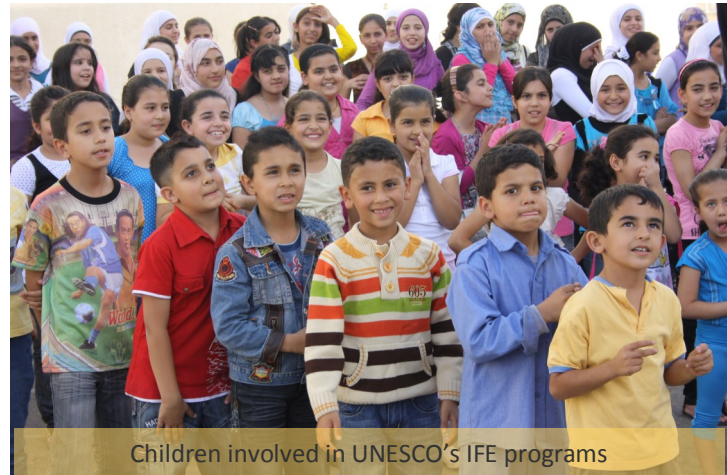
Children involved in UNESCO's IFE programs

The youth skills development component benefits Syrian youth residing in both Za'atari refugee camp and in urban areas in addition to Jordanian youth living in urban areas with limited opportunities for schooling, recreation, mentoring and skills development training.