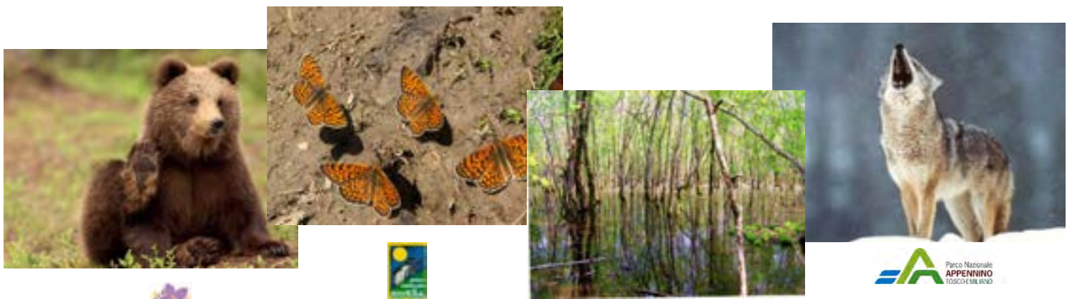
Involvement of other designated territories and sites in Italy

© Ente Parco Nazionale delle Dolomiti Bellunesi ; Ente Parco Nazionale dell'Appennino; Ente Parco Nazionale del Circeo Tosco-emiliano; Ente Parco Nazionale della Sila