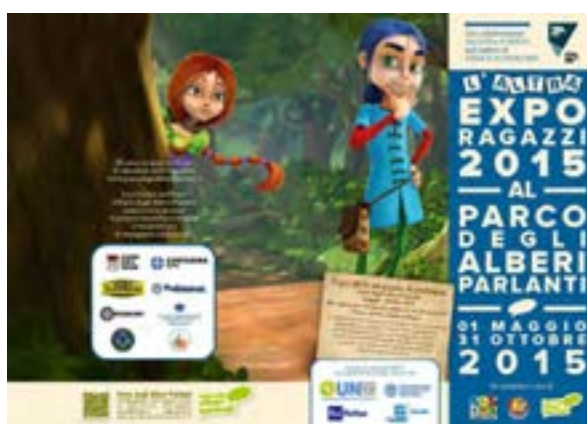
© Gruppo ALCUNI - Parco degli Alberi Parlanti