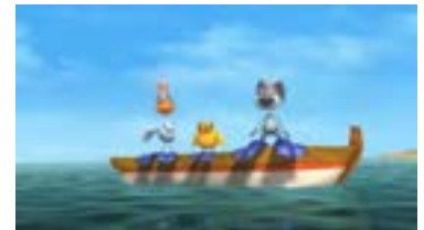
© Gruppo Alcini - I Cuccelli