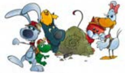
The H2Ooooh! cartoons will also be featured at EXPO in Milan!