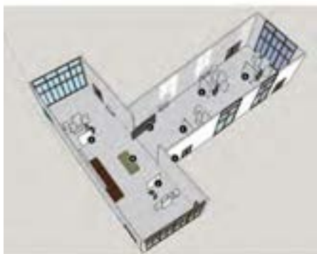
Exhibition map and layout