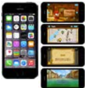
© Gruppo Alcini - Treasure Hunt for Blue Gold App

Gruppo Alcini; RAI Fiction; FAO; UN EXPO 2015