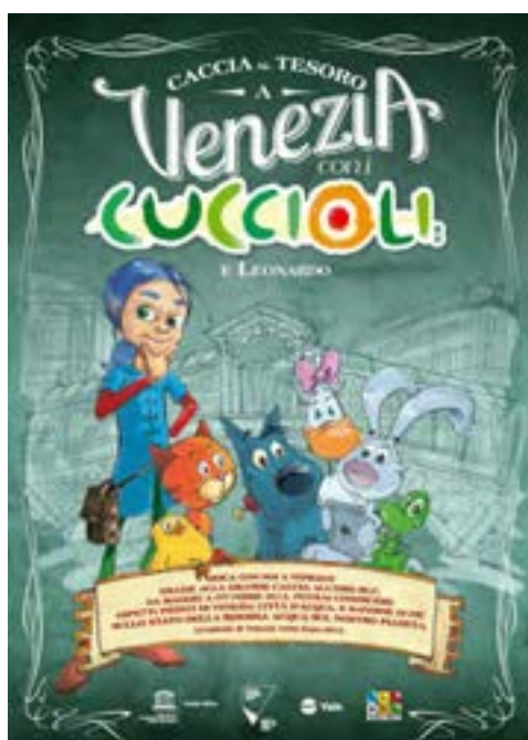
© Gruppo ALCUNI - Leonardo for EXPO