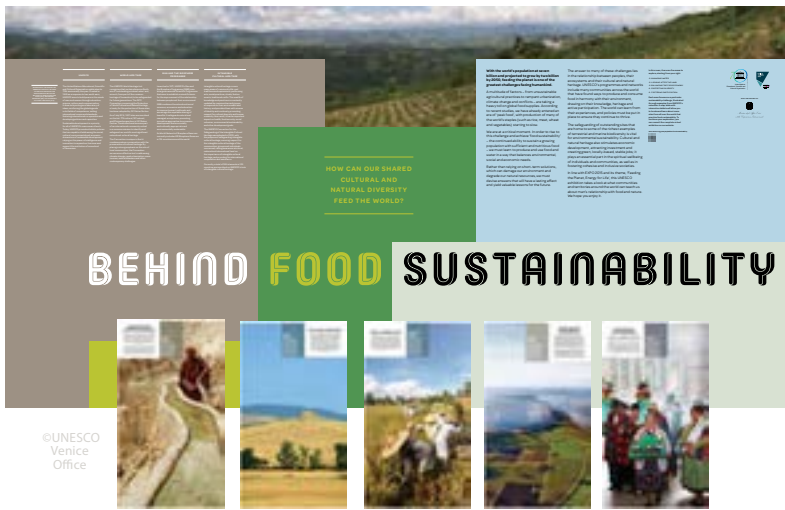
"Behind Food Sustainability" Exhibition