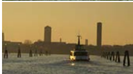
Canals and waterways