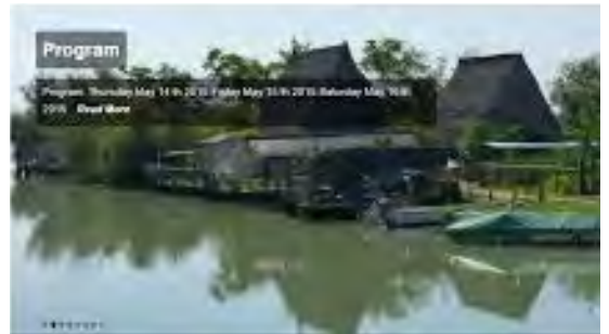
Water Worlds with "Exploring the Venice Lagoon" and "Waterscapes and Historic Canals as a Cultural Heritage"