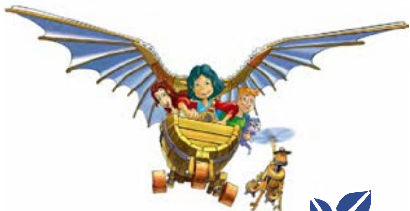
© Gruppo Alcini - Young Leonardo for EXPO