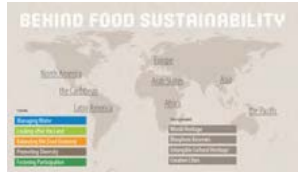
The exhibition by theme, programme and country on the tablets