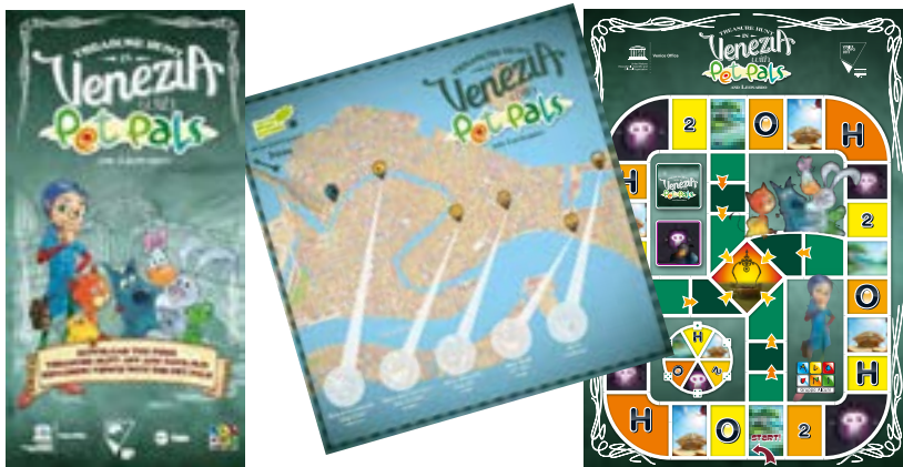
Children's EXPO with the Treasure Hunt, Leonardo EXPO and the Parco degli Alberi Parlanti