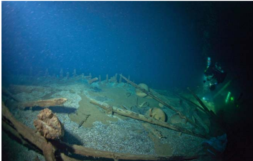
Byzantium shipwreck 2/2 XIII century

In 2004, in conformity with the requirements of the International Convention for the Protection of Underwater Heritage, the Institute of Archaeology of NUAS established the Department of Underwater Heritage of Ukraine - a specialized state-owned enterprise, whose main task is the development of underwater archeology in Ukraine. Scientists of the Department created the first register of underwater cultural heritage of Ukraine, and the map "Monuments of underwater cultural heritage of Ukraine." All known and open objects were put on the state scientific register. All objects of archeology and history in exclusive /marine /economical zone, territorial sea and internal waters of Ukraine were recorded for the first time on the Register and on the map. 2,514 objects were registered. The presence of a gray-hydrogen layer in the Black Sea gives the chance for the discovery of well-preserved monuments even from antiquity in its depths.