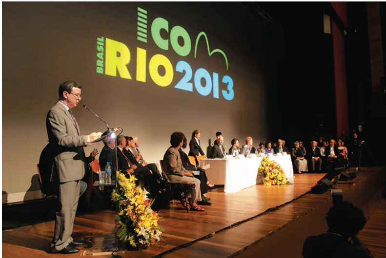
General Conference of the International Council of Museums (ICOM) in Rio de Janeiro, Brazil, 2013

conventions in terms of private law and became one of the chief documents used by law-enforcement agencies in combating illegal trade in cultural property, deserves special mention. The UNIDROIT Convention is characterized by a unified approach to the return of the stolen and illegally exported cultural property, private persons can be claimants, and any stolen cultural property is subject to the convention. This convention implies that cultural property coming from illicit excavations should be considered stolen (i.e., subject to restitution), and also illicitly exported cultural property is subject to restitution, if the plaintiff country has established that the property is of significant cultural importance to it.