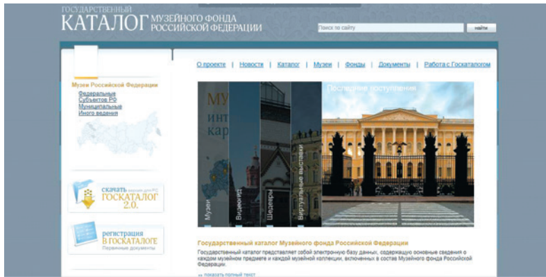
Official web-site of the State Catalogue of Museum Fund of Russian Federation www.goskatalog.ru

Russian Federation, Kazakhstan, and Moldova, but is far from being completed. The development of such catalogues is one of the key elements in the control over the transfer of cultural property. When designing the catalogue, it is reasonable to use recommendations and best practices of the International Committee for Documentation, and at the very least the standard of museum object description in the ObjectID digital format. Moreover, it is important at the legislative level to spell out the necessity to match the State Catalogues with the databases of the law enforcement agencies of the CIS member states.