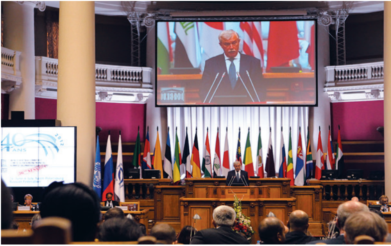
36th session of the World Heritage Committee, Saint-Petersburg, Russia, 2012

of visitors themselves, and also for informing the public about norms and rules the disregard of which results in administrative or even more severe sanctions.