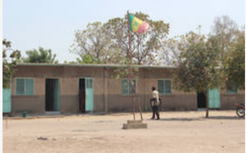
The school of Soucouta, a village on the coast of Senegal

school setting and supported by national education is the most effective and efficient manner to meet the needs.