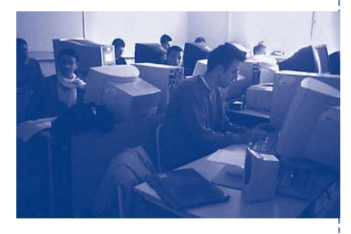
Students at Faculty of Electrical Engineering

Some 12 000 students are presently enrolled at the University, which is mainly funded by the Ministry of Education of SR (with a small financial contribution from the municipalities). There is no specific funding for research activities in the university's budget. Some equipment mainly devoted to student laboratories can be used for research activities.