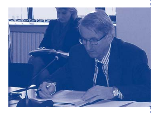
Minister Halilović at the UNESCO Meeting in Sarajevo, 18 October 2005

BiH Federation and its cantons levels, and at the RS level. The Ministry has no funds to support R&D activities. A research policy at the national level is necessary to reconstruct the infrastructures and develop important projects corresponding to established priorities. The Ministry of Civil Affairs has taken the initiative of drafting a Law on Science. A group of experts chaired by the Minister Emir Turkusić (Canton of Sarajevo) are undertaking this responsibility, and the expertise of UNESCO Office in Venice in the process was appreciated. The Ministry considers that the reconstruction of the science and technology potential of BiH is vital for the country's future.