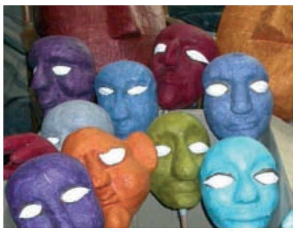
© The Ishara Puppet Theatre Trust