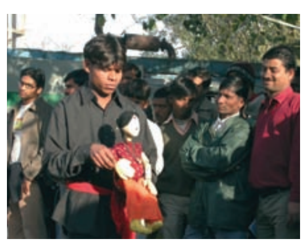
© The Ishara Puppet Theatre Trust

The play will thus portray sensitive issues about individuals and characters without being personal but using irony and humour to drive the point home. This will also pave the use for non-figurative puppetry in the group.