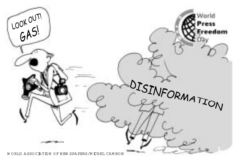
World Association of Newspapers<sup>13</sup>