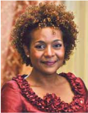
Michaëlle Jean UNESCO Special Envoy to Haiti