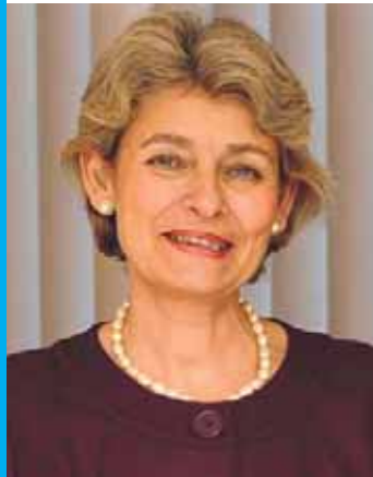
Irina Bokova Director-General of UNESCO

I invite you to join me in this vital challenge.