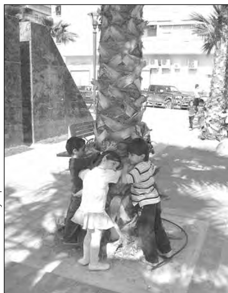
Activities carried out by a policeman of Novelda- Alicante.

As outlined in Appendix I, one important methodological moment from the workshop is the distribution of a questionnaire for teachers aimed at generating reflection, analysis, and debate on human relations, social reality, intercultural challenges, ecology and peace, among others. The questionnaire seeks to raise awareness among participants about their own values. The following are examples of questions used for reflection and self-knowledge: What are the things I believe to be important? What should I know about