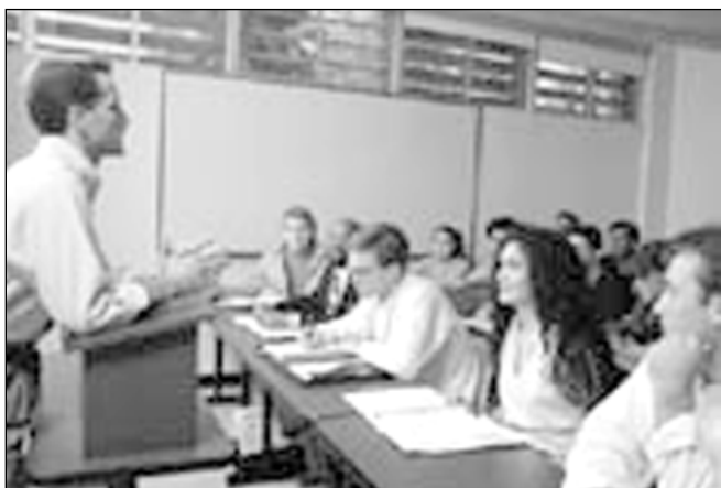
Mendeleyev University of Chemical Technology of Russia organize the first international conference on Chemical Education and Sustainable Development.

The higher education system for engineering in Russia is undergoing a transition to a new educational paradigm - the professional training of future specialists in a holistic manner. Addressing the need for sustainable use of natural resources, energy conservation, environmental protection, prevention of technological accidents, and risk management requires