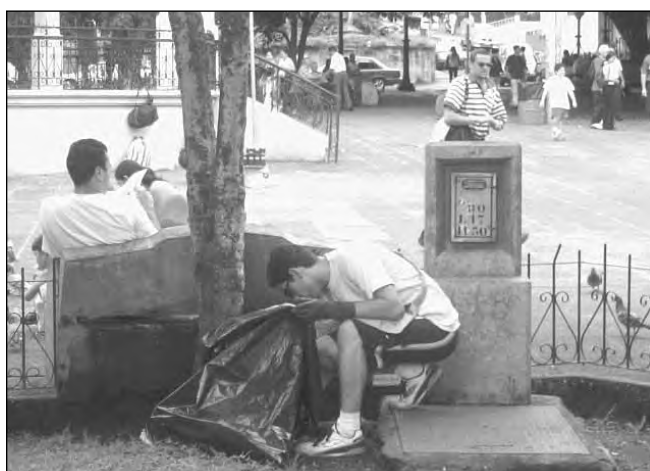
In order to generate public interest in waste management over the past three years, the Centre for General Studies, in collaboration with the Schools of Geography and Environmental Science, has been organizing a waste disposal campaign every October in the central district of Heredia.