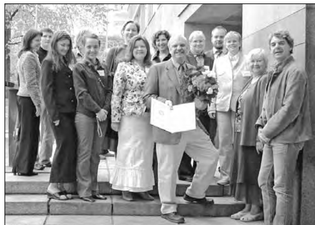
4th JTET Conference, Helsinki, June 1st 2006