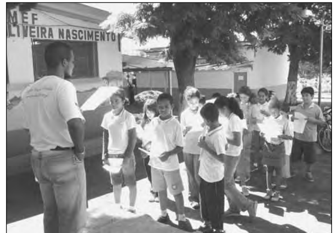
Students and teacher sharing about different interrelated issues.

For example, issues of race, gender, religion, sustainable development, misery, hunger, health, access to information, violence, social and economic justice, and peace have all been identified as areas of concern within the school environment. It has become clear that teachers and pupils are very aware of those issues that must be addressed in order to successfully achieve their – and our – common objectives.