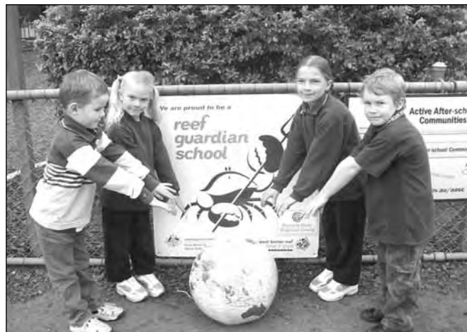
Learning about our place in the world.

The implications for a school community, if all members upheld these four simple principles, are both exciting and challenging. We think that the understanding of, and adherence to, these principles could significantly increase the potential for engaging students in real-life learning and improving student outcomes.