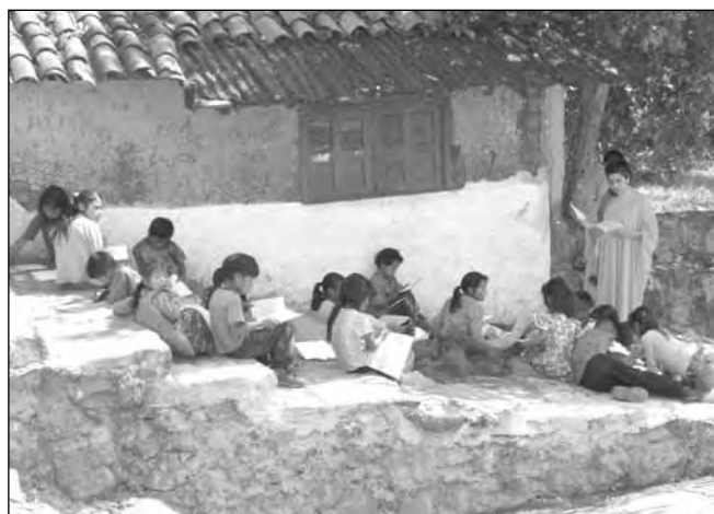
Workshop at Colonia Revolución community.

As a result of this experience, in February 2007, a basic manual and a graphic memoir of the workshops were released with the view to sharing (and replicating) the experiences of these teachers and cultural promoters for children.