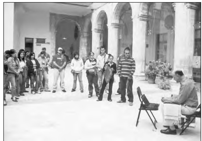
Activities at the Earth Charter Workshop - University of Guanajuato.

Within this context, it should be mentioned that the University of Guanajuato, along with eleven other Mexican universities, joined together to create the Mexican Consortium of University Environmental Programmes for Sustainable Development (Complexus). This university network aims to incorporate an environmental perspective into all of its academic programmes through a cross-disciplinary