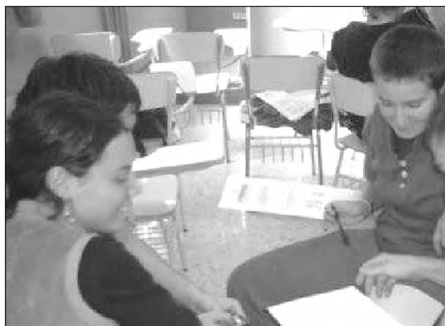
Presentation of the project - POPBL.

The next miracle was the pedagogical experience that we obtained and shared throughout the process of