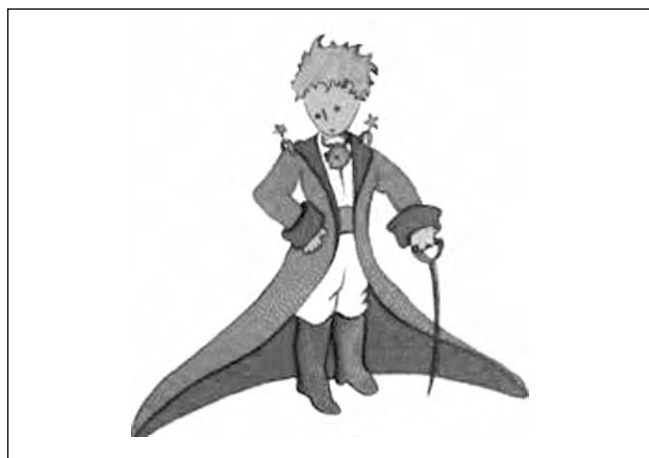
The Earth Charter for Children in Armenian, Russian and English languages.

Together with beautiful pictures and posters drawn by students and pupils, The Earth Charter for Children is very popular in Armenian schools and kindergartens.