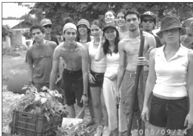
Reforestation project done by CEG students in Puerto Jesus-Guanacaste.

Practical activities are generally considered central to enhancing the teaching-learning process. It is also recommended that students develop their own research problems from relevant research settings. Although professors can serve as a guide and facilitator during the process, they should never impose ways of thinking on their students.