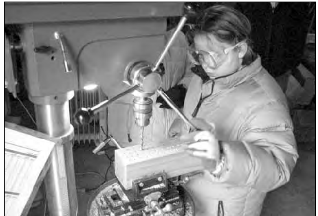
Learning different skills.

The Montessori philosophy of education fits with the UNESCO vision for educating in support of the Decade of Education for Sustainable Development (DESD) with methods that are constructive and participatory; approaches to new material that are integrative and multi-disciplinary; and hands-on activities that are context specific and action-oriented.