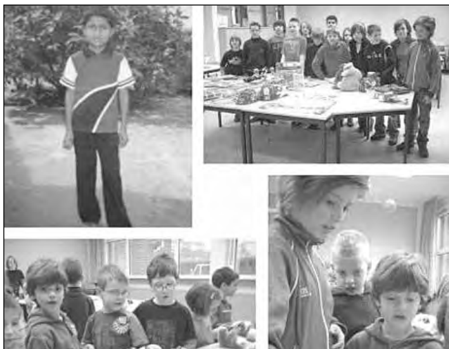
Students of De Kriebel school, olen, belgium.

During Earth Day 2007, the Schools of Cacia organized a Little Earth Charter/Earth Charter school presentation at the City Hall of Aveiro, Portugal. A wide variety of school and community people attended the event, including students and teachers from other schools, parents, the heads of education and environmental departments for the City of Aveiro, the Association of Environmental Education, and the Portuguese Ministry of Education. The students exhibited their LEC art work and photographs of their LEC activities during the past year and performed the song "2 is Interconnected!"