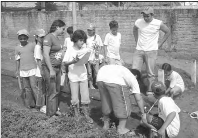
Example of a vegetable garden.

Through the project, the participating schools have also been able to operate collaboratively as a network. This has enabled an increasing exchange of ideas between schools and communities, particularly now that group meetings and discussions are held every month. All of the resources used in the project activities were made readily available to the schools. The vast majority of activities also applied the rule of the Four R's: Reuse, Reduce, Recycle and Rethink.