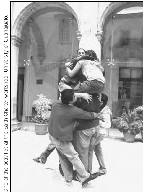
One of the activities at the Earth Charter workshop - University of Guanajuato.

The following table details the programme for an eight-hour workshop. The phases remain the same across all three versions of the workshop, though the exercises vary and the length of time devoted to them is adjusted according to the target group.