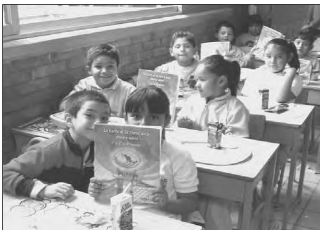
Pilot project with second grade students.