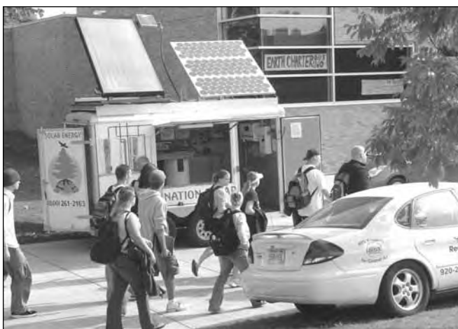
Earth Charter at University of Wisconsin Oshkosh.

Following the first Earth Charter Community Summit in Oshkosh in 2001, the Earth Charter was endorsed by all four elements of the UW Oshkosh's shared governance – faculty, students, academic staff, and classified staff. Top university administrators, including the Chancellor, also gave their enthusiastic support. This was the beginning of a significant re-focusing towards sustainability on campus and engagement with the wider community. Sustainability is now one of the university's "Governing Ideas," along with Collaboration and Engagement.