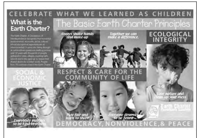
Example of Class Poster.

All these activities are key to helping Earth Scouts learn that they are capable, that they are an important and necessary part of their community, and that both individually and in groups they have the power to have a positive effect in the world.