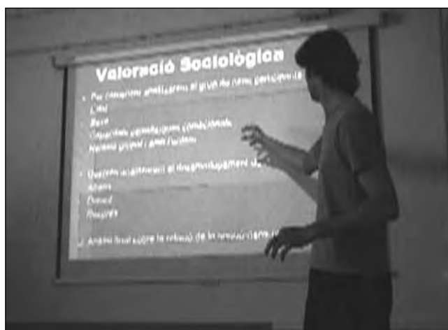
After each activity, and assessment of the impact of each teaching activity is done.

The conclusion of this phase is expected in the year 2010. To date we have produced a descriptive record card for data collection to enable, through the Earth Charter section of the virtual document centre www.praxiologiamotriz.inefc.es , any individual or institution to make an active contribution by sending