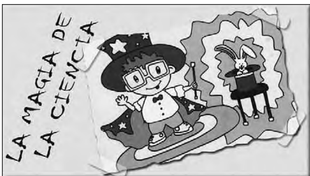
Project - The Magic of Science.

In addition, complementary recreational activities, such as workshops and games, were carried out by the students. These were aimed at the children of the invited schools, where teachers and parents are provided with a detailed description of the features that a good toy should have, as well as the educational toys most suitable to children of every age group.