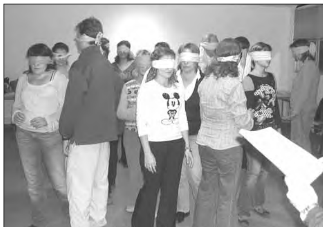
Workshop at CEFIRE de Elche- a center for professor training.

The objective of these 26-hour workshops, held for 2 hours each week, was to promote education on universal values, to familiarize the academic staff of each