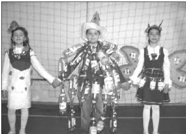
Mini project “Funny Recycling”: 3th graders make theatrical educational presentations.

Teachers helped the students to prepare materials and visual aids in order to demonstrate sustainable and unsustainable energy production and consumption. After the completion of student reports and presentations – carried out during lessons on physics, chemistry and biology –several working groups formed to continue the lively discussions in an informal learning environment. Partners of the project, such as the local branch of Friends of the Earth, have attended these presentations to share the latest scientific information with participants; they have also helped to prepare senior students for future roles as community trainers. This mini-project will continue through 2007.