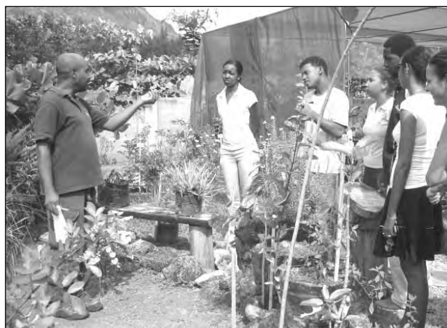
Field trip NEED02 course.

It's important to go outside. In NEED01 students spend a couple of sessions focusing on learning outside the classroom; sometimes it's simply to go outside under a tree to present group-work, and sometimes it's more involved, such as exploring their nearby environment. Students have undertaken environmental audits of the school's grounds, explored the living things found within the school compound, toured the environmental education resources available in their library and at the environmental education unit at the Ministry of Education next door, and have visited the local dump site. For the teachers, using the UNESCO/UNEP CD Teaching for a Sustainable Future has proven to be very helpful to plan and implement these types of activities.