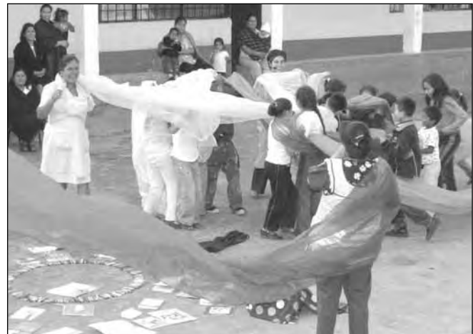
Activities at the community of Nocutzepo.