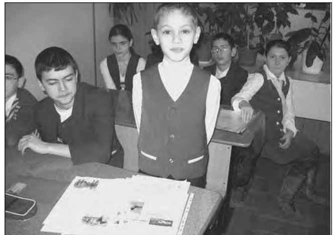
Mini project -Energy is our future-. 4th graders