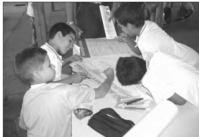
Students reading and drawing the Earth Charter principles.

5 th Phase: Design and implementation of new teaching activities that address those problems identified during the live diagnosis. The new activities can then be used to complement the existing school curriculum, and are aimed at promoting the Earth Charter principles.