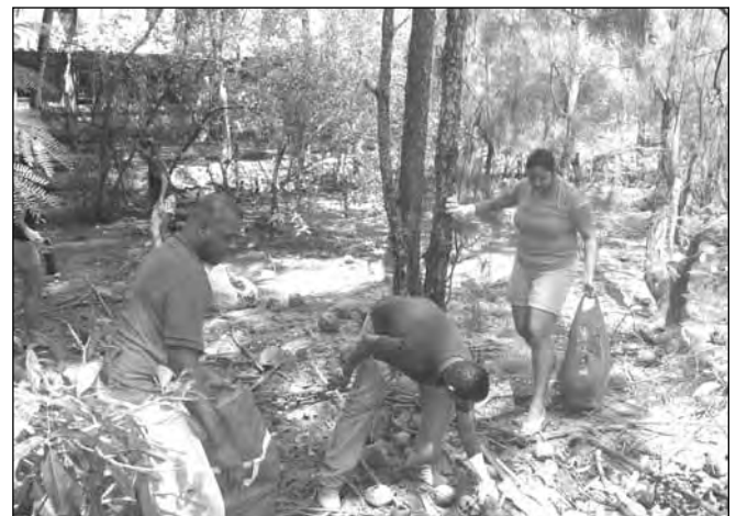
NIE Clean up campaign - Course NEED02.

In NEED02, students are more involved in deciding on which issues to focus. In the third week of class, students choose their group members and then each group selects a different socio-ecological issue to explore. After deciding on what issue to focus, the students practice pedagogical approaches in their research and discussions, such as a problem-solving focused community service-learning method. In addition to identifying and researching their issue, groups are responsible for deciding on possible actions they could take to address or help solve their issue or problem, and then evaluate and report on their work.