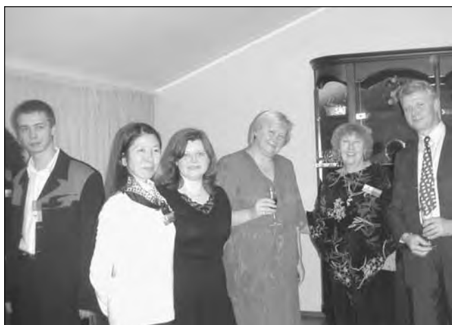
Latvia Daugavpils copy.

While the process of reorientation of education began with the current cadre of teaching professionals, it became clear that institutions of teacher education needed to reorient their pre-service teacher education to address the goals of ESD. Reorienting teacher education is, indeed, a key element in the development of new professionals committed to ESD. This will help them to become 'sustainability change agents' and will considerably shorten the response time for achieving sustainable development goals in education. The initiators of the FEM had a clear vision of this ambitious objective.