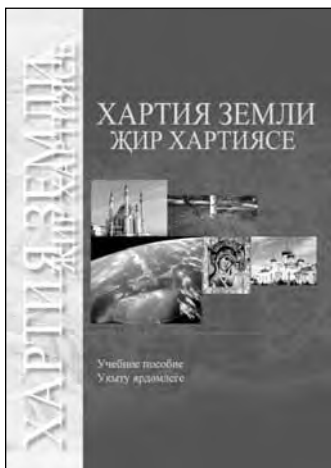
Textbook The Earth Charter for secondary Schools published by the Ministry of Education of Tatarstan.

200 school-protected forest areas, where students provide tangible assistance to forest wardens and biologists – planting new trees, green belts, and picking wild medicinal herbs. Students organize contests, quizzes, and discussions with the members of their communities; put on environmental plays; hold exhibitions; clean parks and gardens; plant new trees; clean school territories and neighbouring communities; take care of forest springs; hold conferences on consumerism; and create, publish and distribute educational leaflets calling for more sustainable lifestyles.