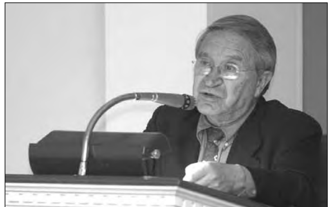
Homero Aridjis- Mexican Poet at Rachel Carson Distinguished Lecture.

Among other initiatives we have developed is a 'Guide to Eating Humanely and Sustainably with the Earth Charter at Florida Gulf Coast University'. The Earth Charter provides an alternative to industrial agriculture and the economic exploitation of labour and environment, challenging us to "Adopt patterns of production, consumption, and reproduction that safeguard Earth's regenerative capacities, human rights, and community wellbeing" (Principle 7). The Guide aims to link Earth Charter ethics to sustainable ways of