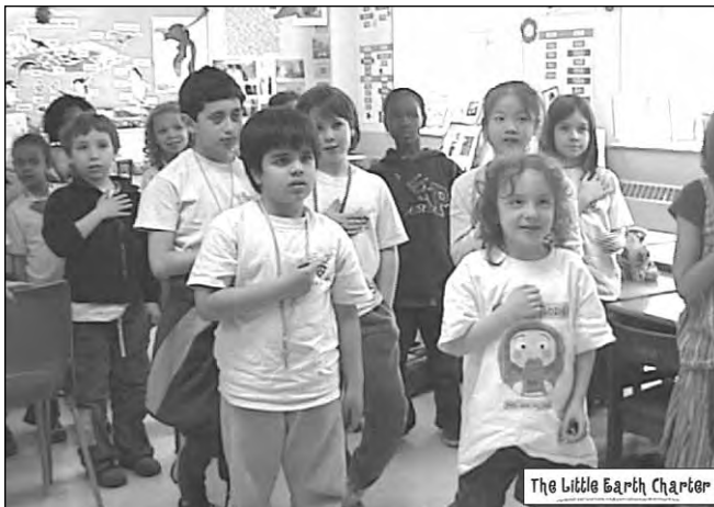
Students carrying out the pledge activity.

Although the LEC is targeted for children four to eight years old, teachers of students as old as thirteen years