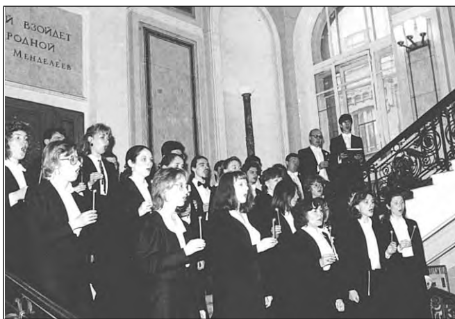
On the century-old grand University staircase. The famous students choir.

In accordance with the Decree, the University, as a member of the Moscow Association of Environmental and Sustainable Development