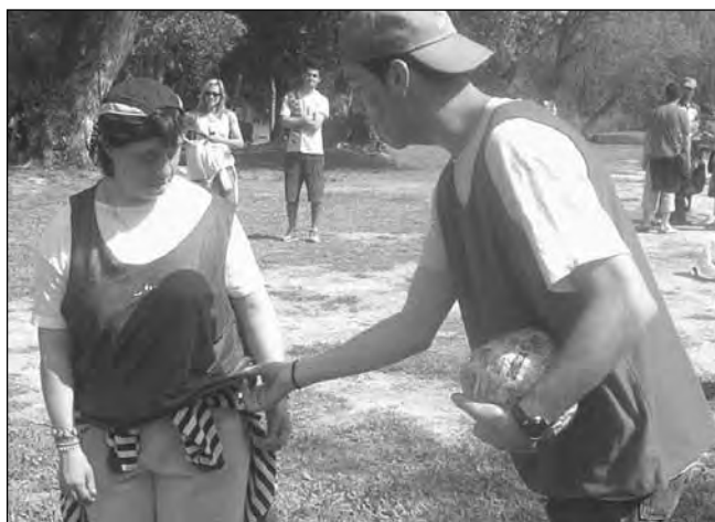
Earth Charter in Motor Action at the Mitjana Park.

For one day, university students, elderly people from the municipal centres, professors and students of the Compulsory Secondary School system (ESO), people with cognitive disabilities, environmental technicians of the City Council of Lleida, university professors,