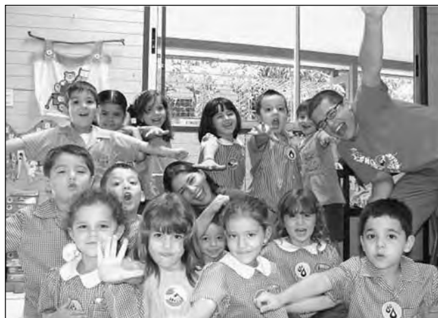
UNA CEG student working with kindergarten children.

There is a general consensus among the faculty of the Centre that one of the most effective means of transmitting and implementing the Earth Charter principles is to encourage real-life engagement between students and local community members. Many of the Centre's courses include methodologies that require analyses of the environmental, social and economic problems faced by local communities, drawing upon the Earth Charter as a framework for action.