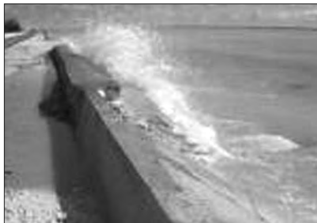
Waves coming over the causeway- Kiribati Island.

The Pacific Calling Campaign and Partnership has made great strides in giving a 'Pacific face' to education and advocacy campaigns aimed at reducing Australia's greenhouse gas emissions, building awareness and increasing access to Australia for environmental refugees from low-lying islands. The following sections describe actions taken by the Partnership to achieve its objectives.