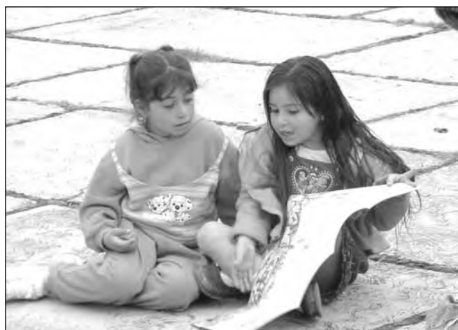
Workshop at Tenencia Lázaro Cárdenas Community.

You will need: Old clothes and fabric for costumes and reusable make-up.