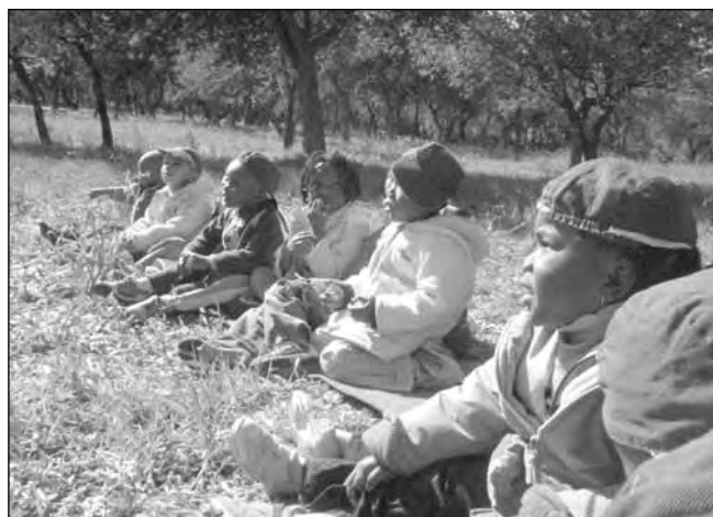
Field trip to Parque Florestal de Monsanto with primary school.

During the course of this project, six hands-on sessions were held in every class of the partner schools. Additionally, two field trips were carried out with nearly 200 children and their respective teachers participating. The field trip to the Lisbon Forest Park was organized for the youngest pupils, featuring nature exploration games and activities. Meanwhile, older students participated in a visit to the National Engineering, Technology and Innovation Institute, where they learned about clean and environmentally-friendly sources of energy, especially sun and wind.