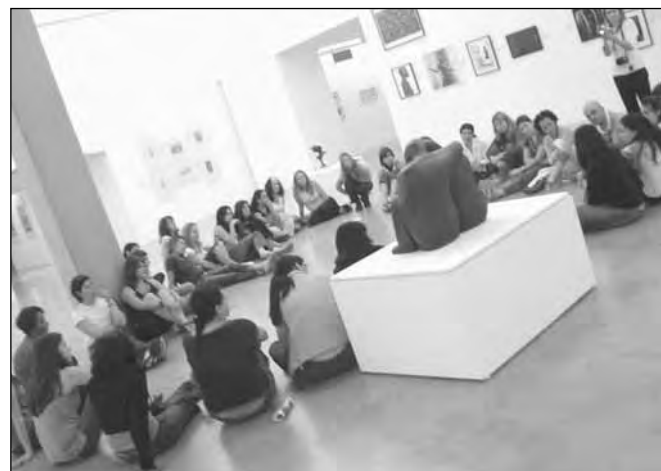
Activities during the workshop.

Now, we ask each person to go to the centre, close to the elements placed there, and to donate something of