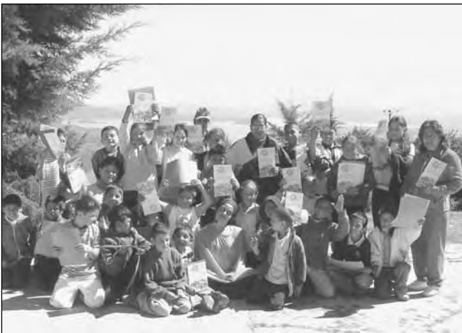
Activities at the community of La Zarzamora

The project has generated an impressive response at the community, family and individual levels. This could be in large part due to the fact that art is a means of expression that dignifies action, and community members readily embraced the Earth Charter as an expression about what they would like to improve in their relationships, community, and environment. In