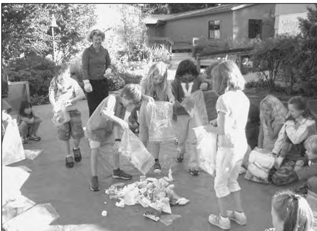
Children learning about waste management.

The staff of Voyager were introduced to the Earth Charter when they attended a workshop entitled, “The Earth Charter: Local and Global Connections for Earth Day” held for 70 K–12 educators in March 2006. The programme was co-presented and sponsored by YES!