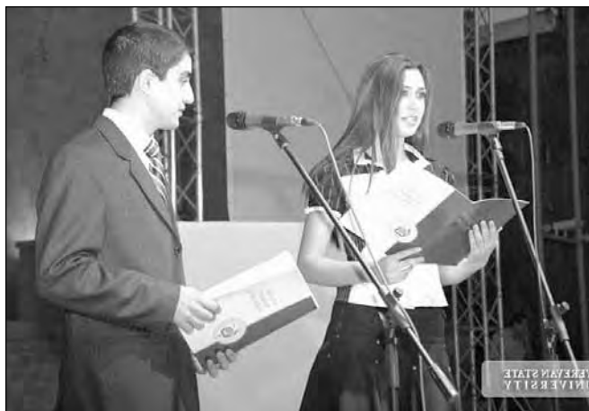
The oath of the University freshmen.

She starts her course by handing out the Earth Charter brochure (in Armenian, Russian and English languages) to the students, so that they can read this at home. In her classroom, discussion is encouraged. To facilitate practical exercise, she breaks students into four working groups in accordance with the four main pillars of the