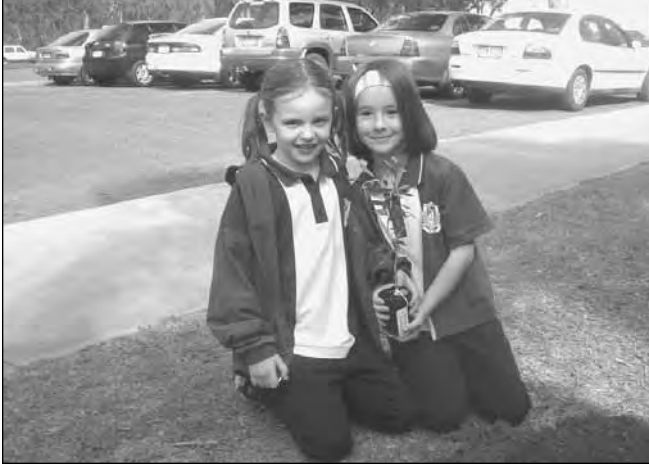
Tree planting day.

Our approach embraces our young people's initial abstract thinking about global issues by linking them directly to everyday local environmental problems. Action Science has indeed always been underpinned by the principles of the Earth Charter, even though we didn't formally recognize this. Our implementation of the Earth Charter into our school curriculum has added another positive dimension to Action Science; students are able to see the importance of their local work more clearly in terms of its global impact. It reinforces the idea that we all have a role in creating a sustainable future and that each positive action contributes to the wellbeing of our planet and its inhabitants.