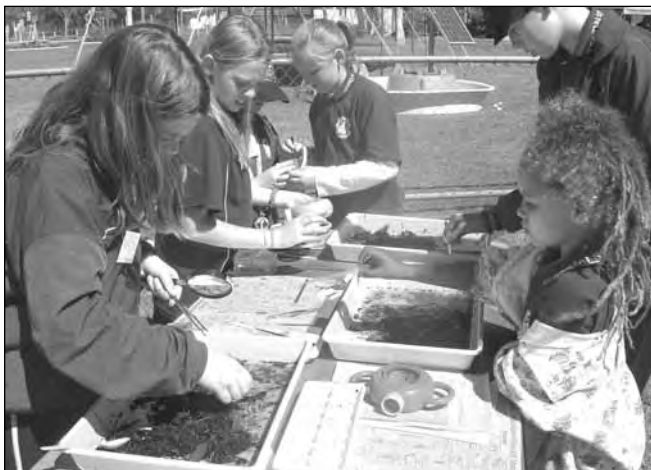
Learning about the diversity of life.

The first step in the process was putting teachers into planning teams to map out how the Earth Charter could be used as an underpinning philosophy for current and future units of work. Teachers examined available Earth Charter resources (DVD, posters, web resources) and were each given an Earth Charter poster to put up in their classrooms. The result of this day was the development of our 2007 Sustainability Action Plan,