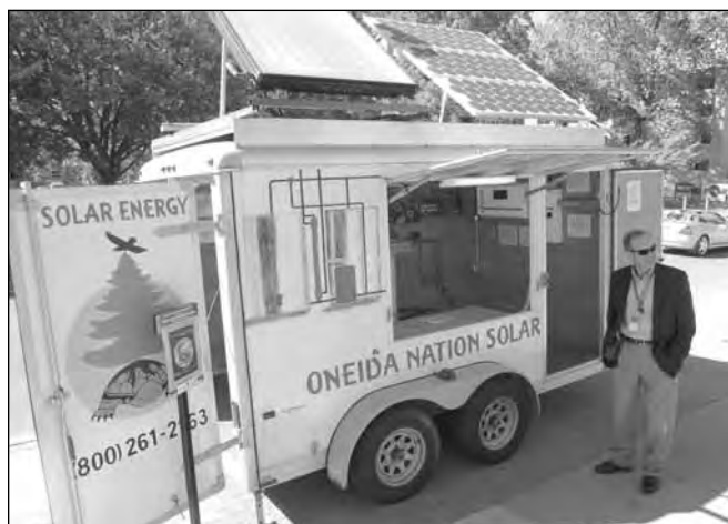
Exposition about alternative energy sources.

UW Oshkosh has also implemented a series of energy conserving building retrofits on existing buildings on