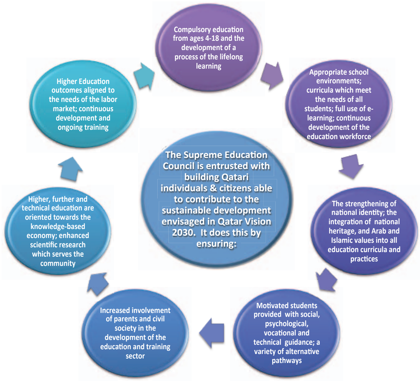
Figure 2. Overview of Strategy Achievements

The ETS strategic plans cover five programs that together provide a comprehensive, integrated strategy for the sector, emphasizing the alignment of K-12 education to vocational and higher education and labor force needs. The five programs are: 1) Core and Cross-Cutting Education and Training; 2) Improving K-12 General Education; 3) Improving Higher Education; 4) Strengthening Technical and Vocational Education and Training; and 5) Enhancing Scientific Research. In the following sections we describe each program, corresponding outcomes, key performance indicators and projects, followed by project timelines.