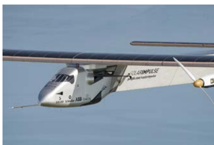
Sideview of Solar Impulse 2 in flight above Switzerland